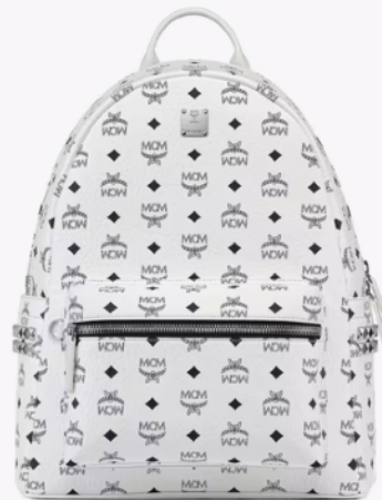
STARK SIDE STUDS BACKPACK IN VISETOS (MEDIUM) THB 51,500 / NOW THB 36,050