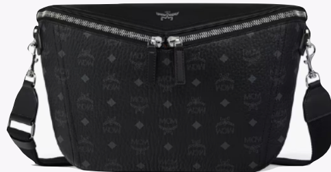
DIAMANT 3D CROSSBODY IN VISETOS LEATHER MIX (MEDIUM)