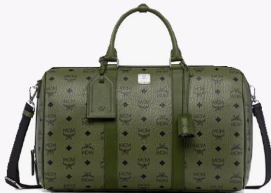
OTTOMAR WEEKENDER BAG IN VISETOS THB 48,800 / NOW THB 29,280