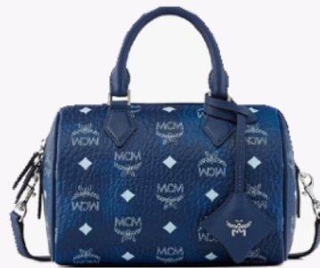
ELLA BOSTON BAG IN VISETOS THB 35,300 / NOW THB 21,180