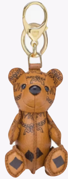
MCM PARK BEAR CHARM IN VISETOS