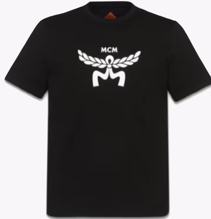
LAUREL LOGO PRINT T-SHIRT IN ORGANIC COTTON SIZE : S,M,L,XL THB 11,000 / NOW THB 5,500