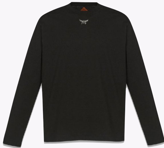
ESSENTIAL LAUREL LOGO SHIRT IN ORGANIC COTTON SIZE : M THB 11,000 / NOW THB 5,500