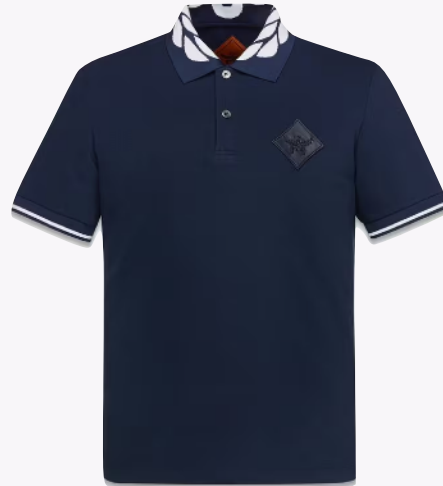
LAUREL PIQUÉ POLO SIZE : S,M,L THB 13,500 / NOW THB 6,750