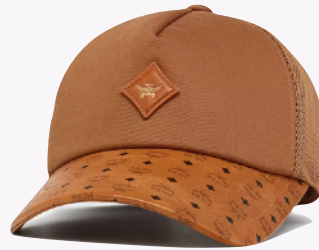
DIAMOND CAP IN COTTON AND MONOGRAM PRINT LEATHER