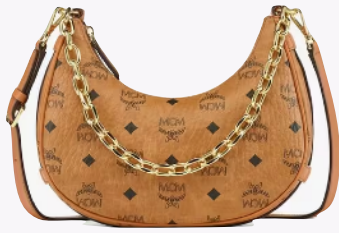
AREN CRESCENT HOBO BAG IN VISETOS