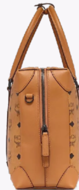
MCM KLASSIK TOTE IN MONOGRAM LEATHER (MEDIUM)