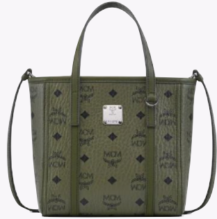
TONI TOP-ZIP SHOPPER IN VISETOS (MINI) THB 26,200 / NOW THB 15,720