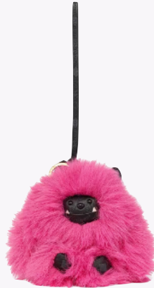
AREN MARSDOG CHARM IN FAUX FUR VISETOS