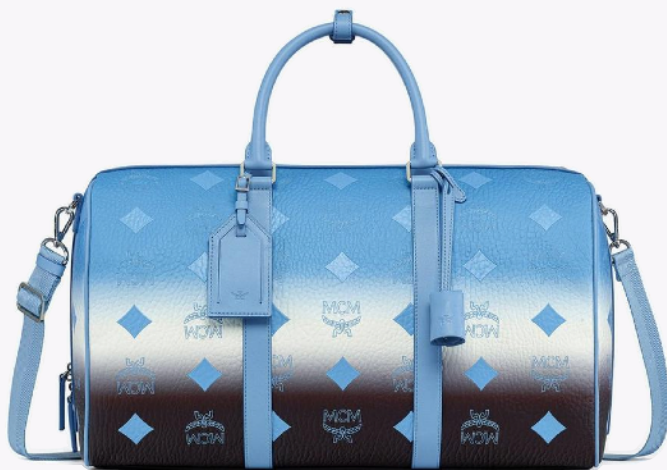
OTTOMAR WEEKENDER BAG IN GRADATION VISETOS (MEDIUM)