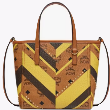
STSTUDED TONI TOP-ZIP SHOPPER IN MEGA HERRINGBONE VISETOS