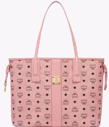
REVERSIBLE LIZ SHOPPER IN VISETOS (MEDIUM)