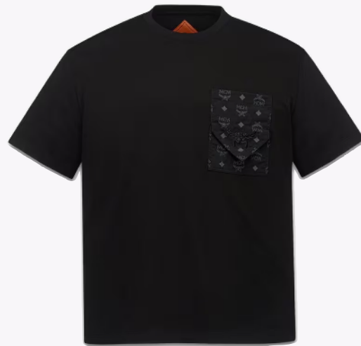
MONOGRAM PATCH POCKET T-SHIRT IN ORGANIC COTTON SIZE XS,S,M