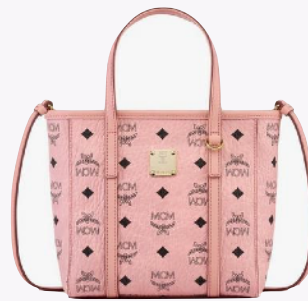
TONI TOP-ZIP SHOPPER IN VISETOS (MINI) THB 26,200 / NOW THB 18,340