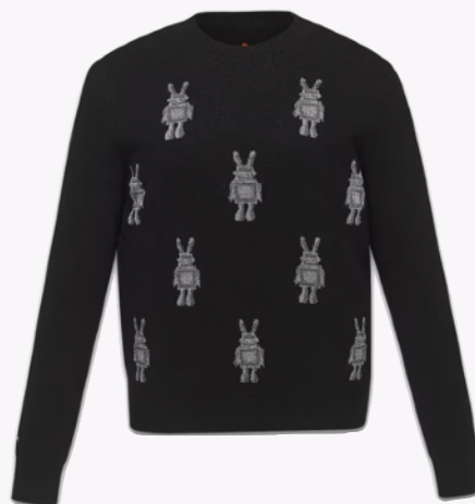
RABOT SWEATER IN WOOL JACQUARD SIZE S,M