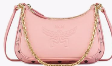
AREN DUO HOBO IN VISETOS