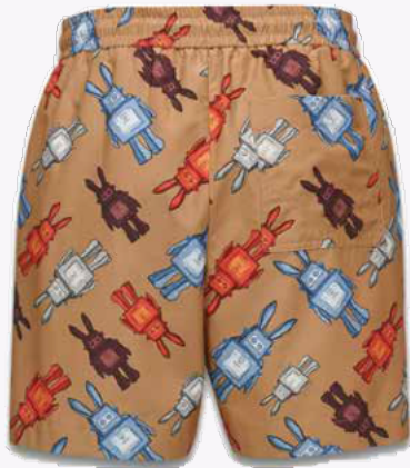
RABOT SHORTS SIZE 46,48