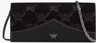
DIAMOND CLUTCH IN LAURETOS LUREX JACQUARD (SMALL) THB 31,300 / NOW THB 21,910