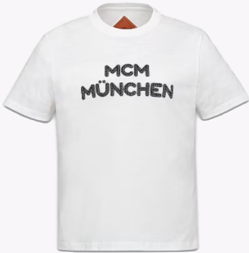
MÜNCHEN T-SHIRT IN ORGANIC COTTON SIZE S,L