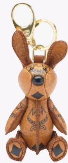
MCM PARK RABBIT CHARM IN VISETOS