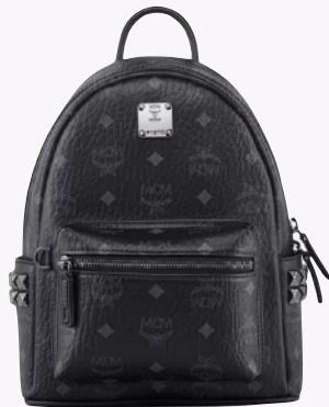
STARK SIDE STUDS BACKPACK IN VISETOS (MINI) THB 42,300 / NOW THB 29,610