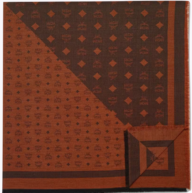
MONOGRAM SHAWL IN WOOL-SILK JACQUARD