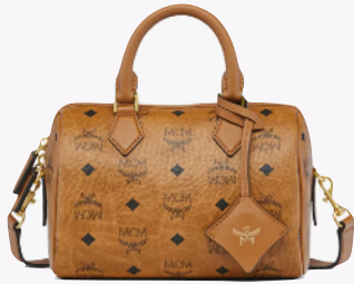
ELLA BOSTON BAG IN VISETOS (SMALL) THB 35,300 / NOW THB 24,710