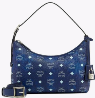
AREN HOBO IN VISETOS (MEDIUM) THB 35,000 / NOW THB 21,000