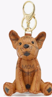
MCM M PUP CHARM IN VISETOS