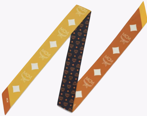
REVERSIBLE MONOGRAM PRINT PETITE SCARF IN ORGANIC SILK