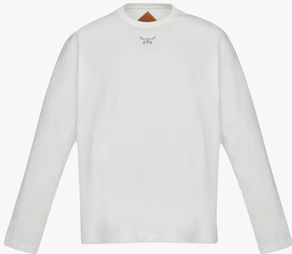
ESSENTIAL LAUREL LOGO SHIRT IN ORGANIC COTTON SIZE : M,L THB 11,000 / NOW THB 5,500