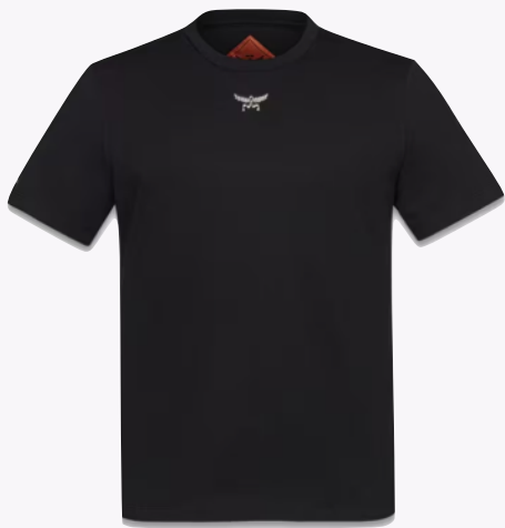
ESSENTIAL LOGO PRINT T-SHIRT IN ORGANIC COTTON SIZE : S,M,L THB 8,300 / NOW THB 4,150