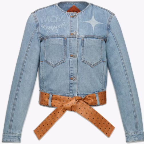
RABOT SHORTS SIZE 40,42,44 THB 35,000 / NOW THB 21,000