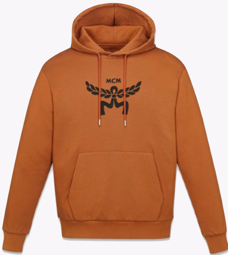
CLASSIC LOGO HOODIE IN ORGANIC COTTON SIZE : S,M,L,XL THB 19,000 / NOW THB 9,500