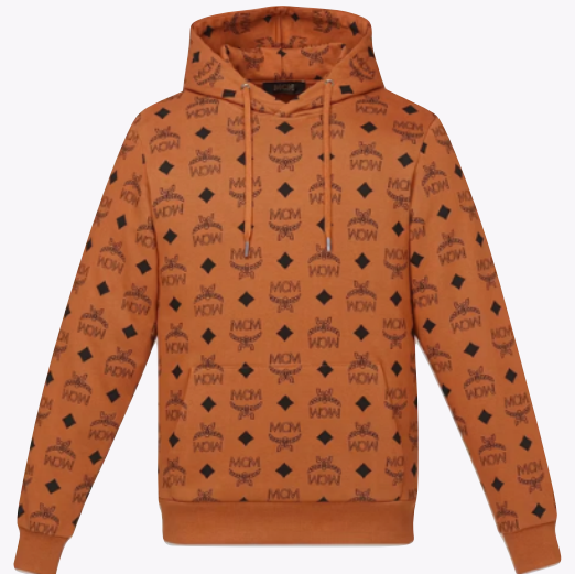
MAXI MONOGRAM PRINT HOODIE IN ORGANIC COTTON SIZE : M,L THB 19,000 / NOW THB 9,500