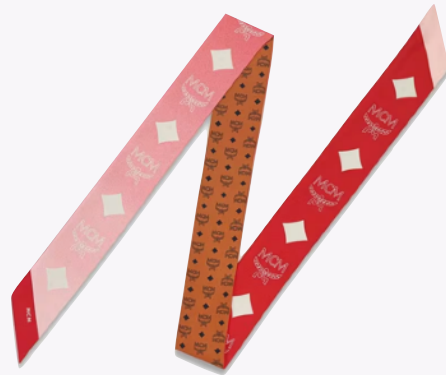
REVERSIBLE MONOGRAM PRINT PETITE SCARF IN ORGANIC SILK