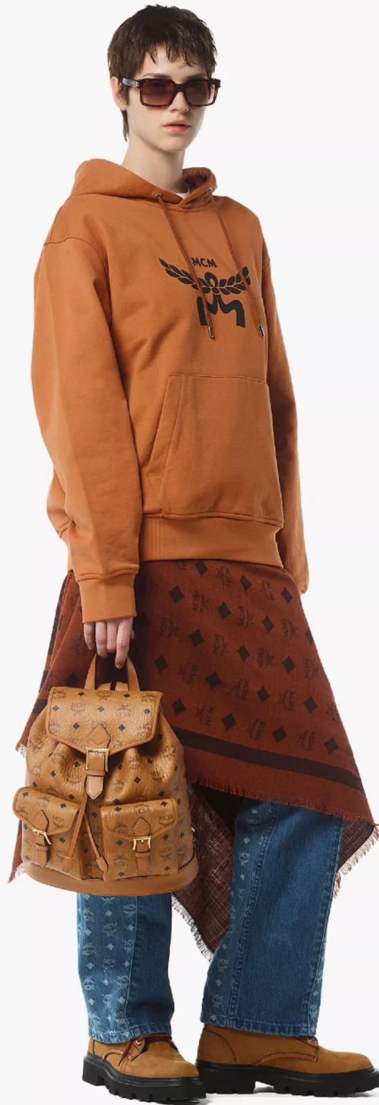
AREN DRAWSTRING BACKPACK IN VISETOS