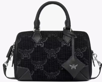
ELLA BOSTON BAG IN LAURETOS LUREX JACQUARD (SMALL) THB 35,300 / NOW THB 24,710