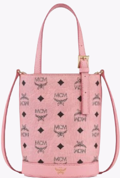
AREN BUCKET TOTE IN VISETOS (MINI)