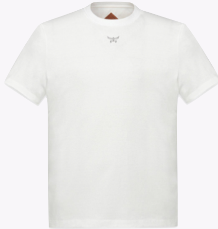
ESSENTIAL LOGO PRINT T-SHIRT IN ORGANIC COTTON SIZE : S,XL THB 8,300 / NOW THB 4,150