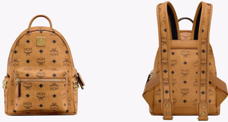
STARK SIDE STUDS BACKPACK IN VISETOS (MINI) THB 38,500 / NOW THB 26,950