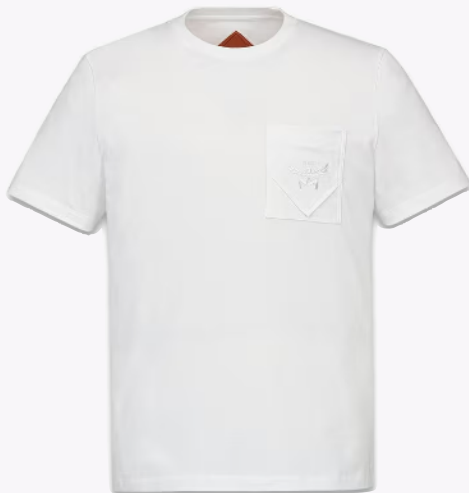
ESSENTIAL LOGO POCKET T-SHIRT IN ORGANIC COTTON SIZE L,XL