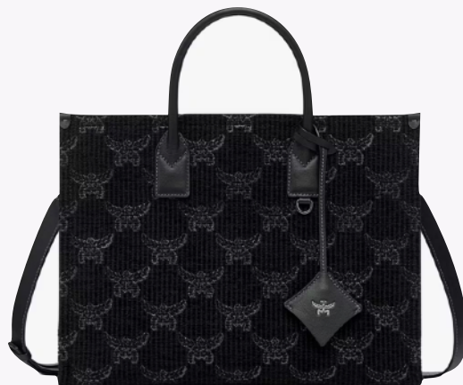
MÜNCHEN TOTE N LAURETOS LUREX JACQUARD (LARGE) THB 44,100 / NOW THB 30,870