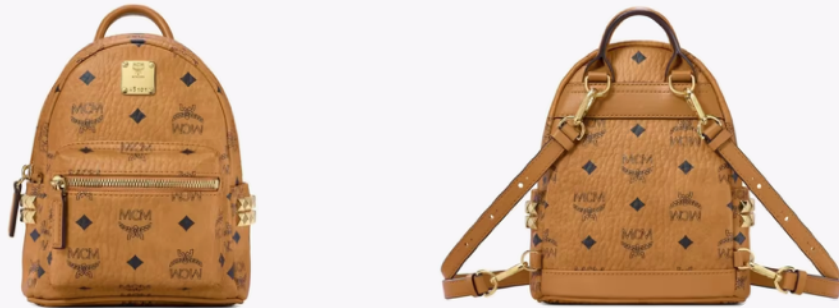
STARK BEBE BOO SIDE STUDS BACKPACK IN VISETOS (X-MINI) THB 37,500 / NOW THB 18,750