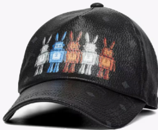
CLASSIC CAP IN RABOT VISETOS