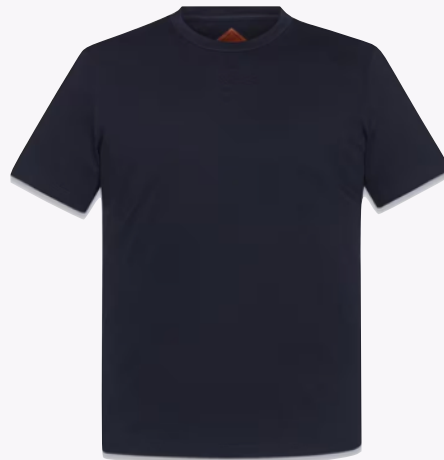
SILKET LOG T-SHIRT SIZE : S,XL THB 9,600 / NOW THB 4,800