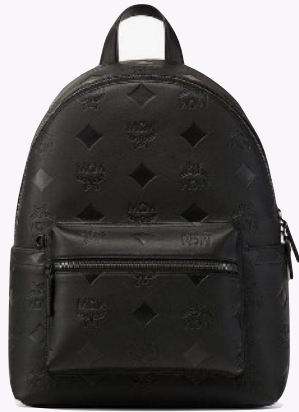
STARK BACKPACK IN MAXI MONOGRAM LEATHER (MEDIUM)