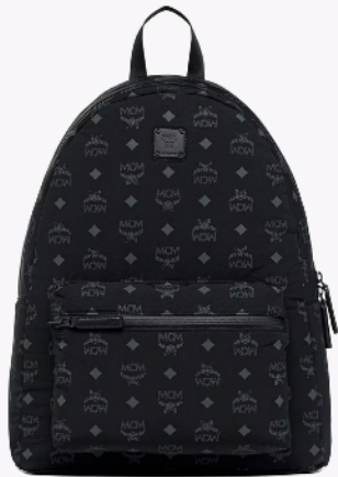
STARK PACKABLE BACKPACK IN MONOGRAM NYLON (MEDIUM)