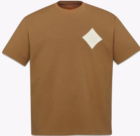
LOGO PATCH BOUCLÉ T-SHIRT SIZE : S,L,XL THB 13,500 / NOW THB 6,750