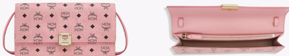
AREN CROSSBODY WALLET IN VISETOS