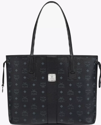
REVERSIBLE LIZ SHOPPER IN VISETOS (MEDIUM)