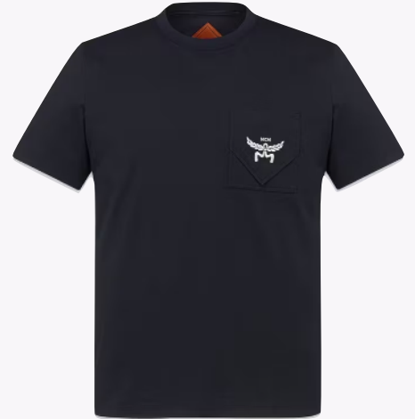
ESSENTIAL LOGO PRINT T-SHIRT IN ORGANIC COTTON SIZE : L,XL THB 8,300 / NOW THB 4,150