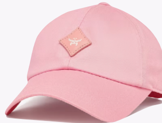
ESSENTIAL DIAMOND CAP IN COTTON TWILL