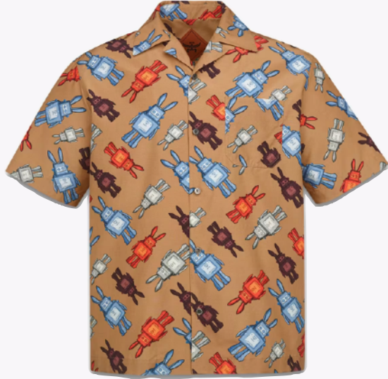
RABOT SHORTS SIZE 48