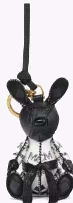
AREN TAEKWONDO RABBIT CHARM IN VISETOS