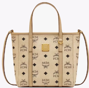
TONI TOP-ZIP SHOPPER IN VISETOS (MINI) THB 26,200 / NOW THB 18,340