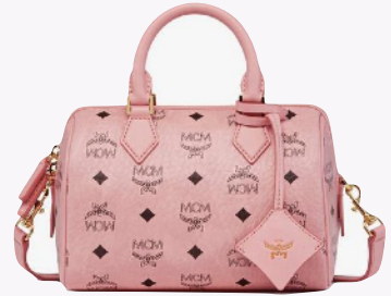
ELLA BOSTON BAG IN VISETOS (SMALL) THB 35,300 / NOW THB 24,710