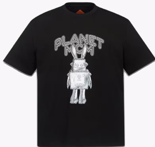
PLANET MCM RABOT T-SHIRT IN ORGANIC COTTON SIZE S