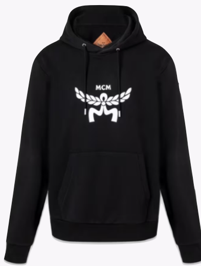
CLASSIC LOGO HOODIE IN ORGANIC COTTON SIZE : M,L,XL THB 19,000 / NOW THB 9,500