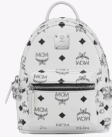
STARK SIDE STUDS BACKPACK IN VISETOS (X-MINI) THB 37,500 / NOW THB 26,250