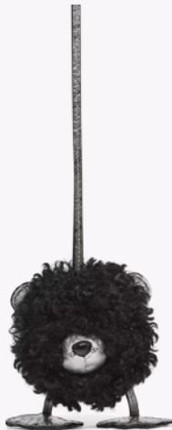
AREN BEAR CHARM IN FAUX FUR