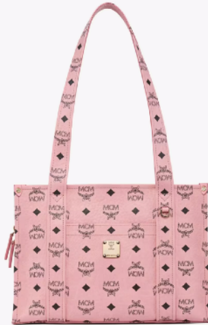
AREN SCHOOL BAG TOTE IN VISETOS (SMALL)