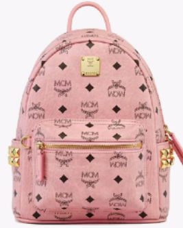
STARK SIDE STUDS BACKPACK IN VISETOS (MINI) THB 42,300 / NOW THB 29,610