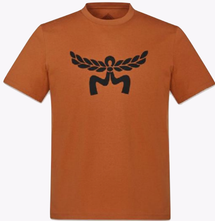
LAUREL LOGO PRINT T-SHIRT IN ORGANIC COTTON SIZE : S,M,L,XL THB 11,000 / NOW THB 5,500