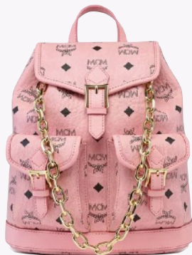
AREN DRAWSTRING BACKPACK IN VISETOS (MINI)