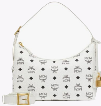
AREN HOBO IN VISETOS