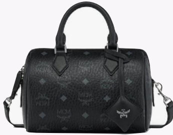
ELLA BOSTON BAG IN VISETOS (SMALL) THB 35,300 / NOW THB 24,710