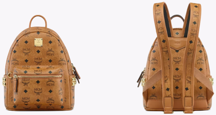
STARK SIDE STUDS BACKPACK IN VISETOS (MINI) THB 42,300 / NOW THB 29,610