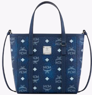
TONI TOP-ZIP SHOPPER IN VISETOS (MINI) THB 26,200 / NOW THB 15,720