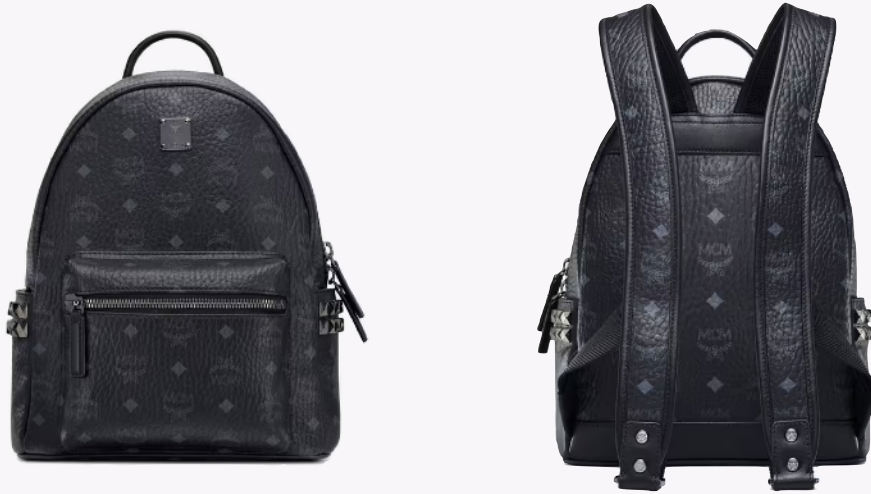
STARK SIDE STUDS BACKPACK IN VIETOS (SMALL) THB 42,800 / NOW THB 29,960