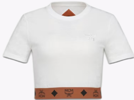
MONOGRAM CROPPED T-SHIRT IN ORGANIC COTTON SIZE S