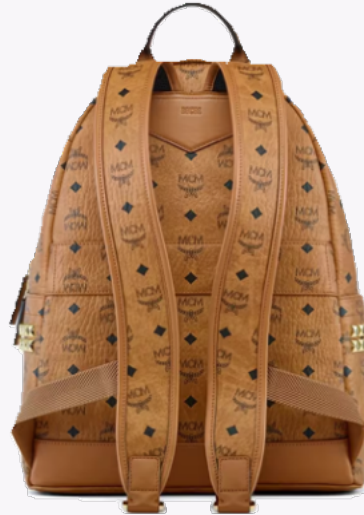
STARK SIDE STUDS BACKPACK IN VISETOS (MEDIUM)