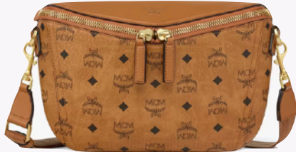
DIAMANT 3D CROSSBODY IN VISETOS LEATHER MIX (SMALL)