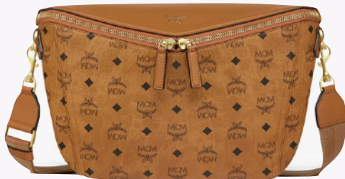
DIAMANT 3D CROSSBODY IN VISETOS LEATHER MIX (MEDIUM)