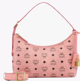
AREN HOBO IN VISETOS