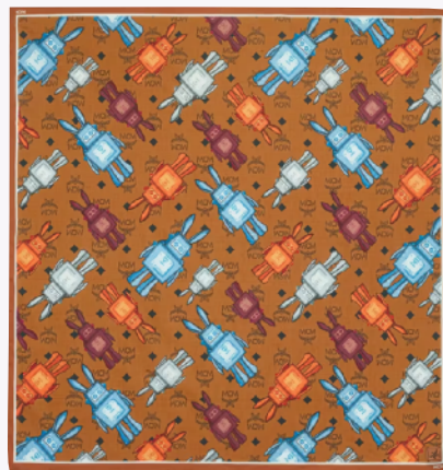
GRADATION MONOGRAM SCARF IN ORGANIC SILK