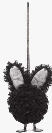
AREN RABBIT CHARM IN FAUX FUR