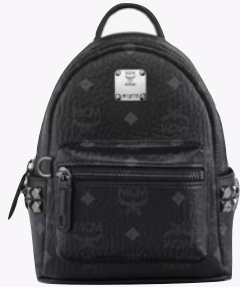
STARK BEBE BOO SIDE STUDS BACKPACK IN VISETOS (X-MINI) THB 37,500 / NOW THB 26,250