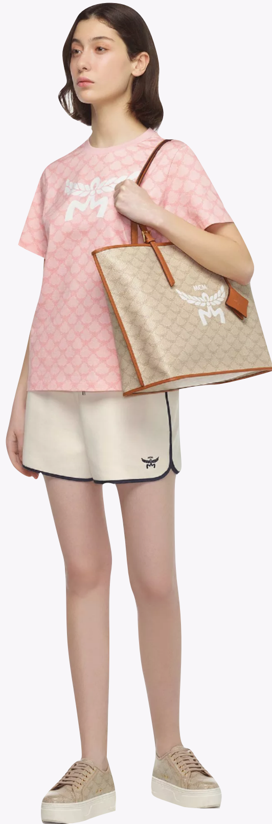
HIMMEL SHOPPER IN LAURETOS (MEDIUM) THB 27,300 / NOW THB 13,650