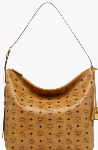
AREN HOBO IN VISETOS (LARGE)