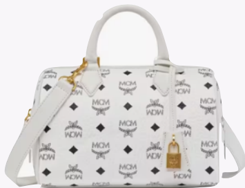
ELLA BOSTON BAG IN VISETOS (SMALL)