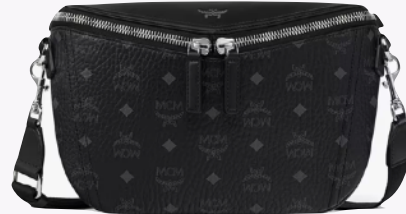
DIAMANT 3D CROSSBODY IN VISETOS LEATHER MIX (SMALL)