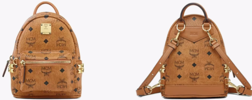
STARK BEBE BOO SIDE STUDS BACKPACK IN VISETOS (X-MINI) THB 37,500 / NOW THB 18,750