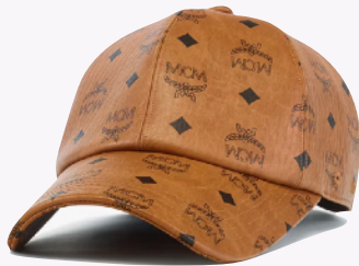
CLASSIC CAP IN VISETOS