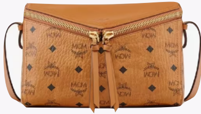
DIAMANT 3D SHOULDER BAG IN VISETOS LEATHER MIX