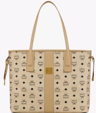
REVERSIBLE LIZ SHOPPER IN VISETOS (MEDIUM)