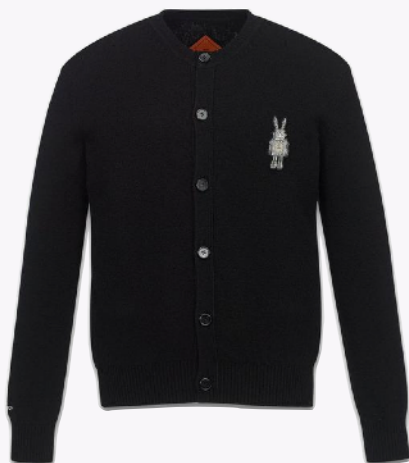
RABOT PATCH WOOL KNIT CARDIGAN SIZE M,L