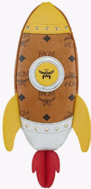
AREN ROCKET CROSSBODY IN VISETOS SIZE S