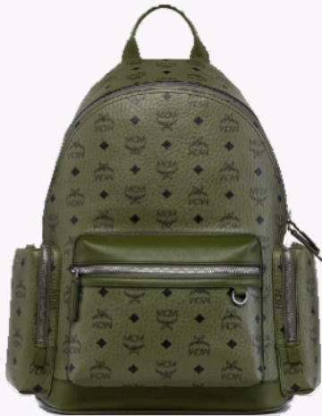
STARK BACKPACK IN VISETOS (MEDIUM) THB 51,500 / NOW THB 30,900