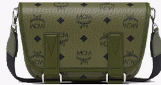
AREN MESSENGER IN VISETOS THB 28,600 / NOW THB 17,160