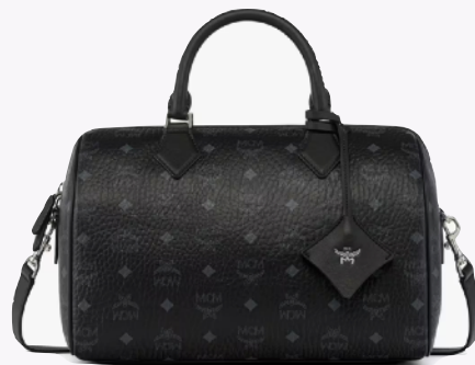
ELLA BOSTON BAG IN VISETOS (MEDIUM) THB 37,100 / NOW THB 25,970