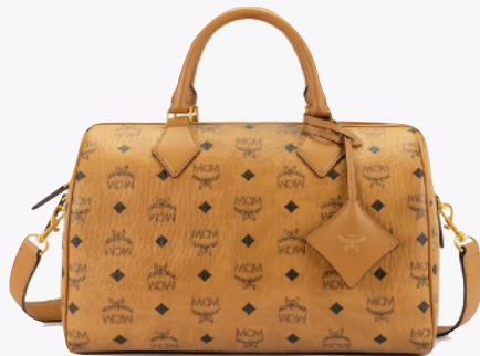
ELLA BOSTON BAG IN VISETOS (MEDIUM) THB 37,100 / NOW THB 25,970