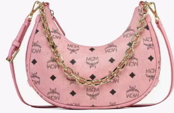
AREN CRESCENT HOBO BAG IN VISETOS