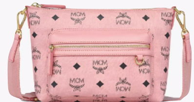
AREN CROSSBODY IN VISETOS (SMALL)