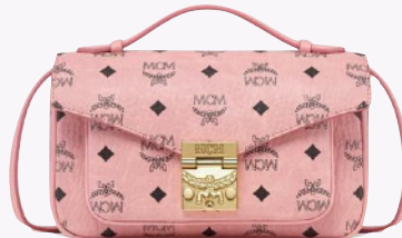
TRACY CROSSBODY IN VISETOS (MEDIUM)