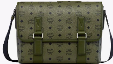
AREN MESSENGER IN VISETOS THB 35,500 / NOW THB 21,300