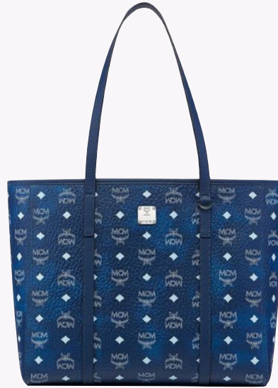
TONI TOP-ZIP SHOPPER IN VISETOS (MEDIUM) THB 29,200 / NOW THB 17,520