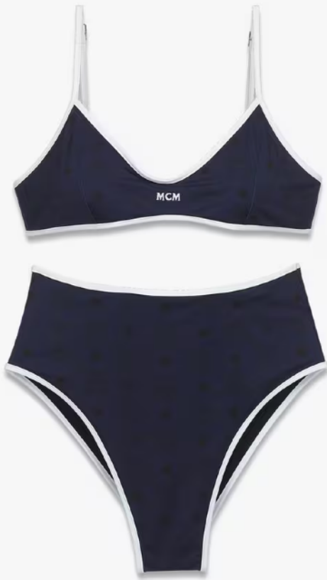
LAUREL LOGO BIKINI