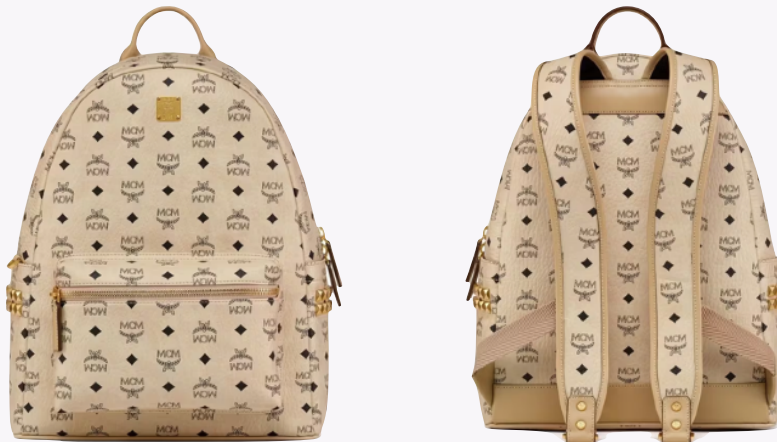
STARK SIDE STUDS BACKPACK IN VISETOS (MEDIUM)