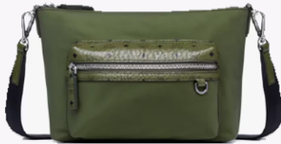
AREN CROSBODY IN ECONYL® AND LEATHER THB 21,500 / NOW THB 12,900