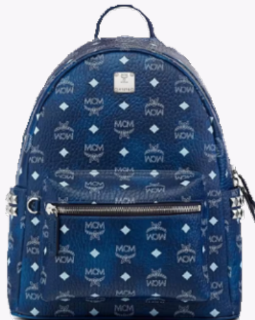
STARK SIDE STUDS BACKPACK IN VISETOS (SMALL-MEDIUM)