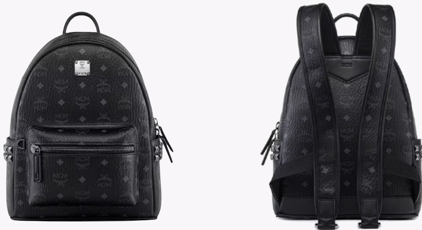
STARK SIDE STUDS BACKPACK IN VIETOS (SMALL) THB 44,100 / NOW THB 30,870