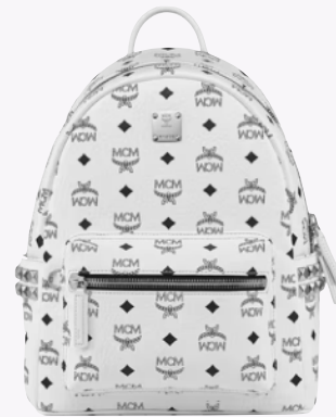
STARK SIDE STUDS BACKPACK IN VISETOS (SMALL) THB 44,100 / NOW THB 30,870