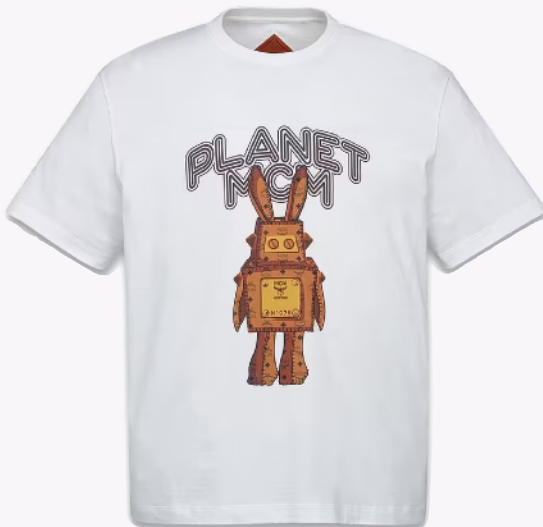
PLANET MCM RABOT T-SHIRT IN ORGANIC COTTON SIZE S,M