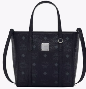
TONI TOP-ZIP SHOPPER IN VISETOS (MINI) THB 26,200 / NOW THB 18,340