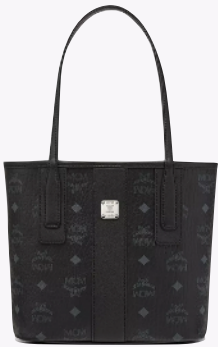
REVERSIBLE LIZ SHOPPER IN VISETOS (MINI)