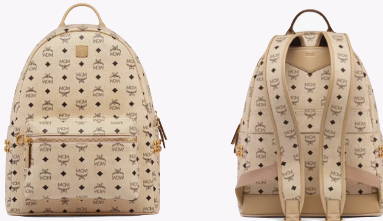
STARK SIDE STUDS BACKPACK IN VISETOS (MEDIUM)