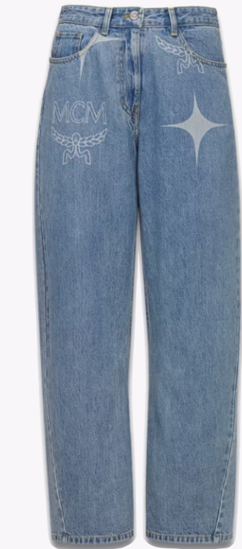
CONSTELLATION DENIM JEANS SIZE 38,40 THB 20,400 / NOW THB 12,240