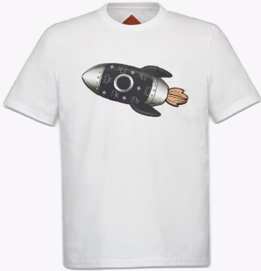
ROCKET T-SHIRT IN ORGANIC COTTON SIZE S,M,L,XL