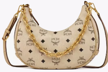
AREN CRESCENT HOBO BAG IN VISETOS