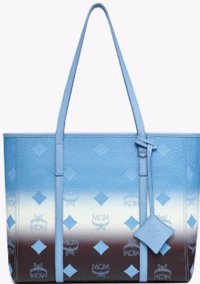
TONI TOP-ZIP SHOPPER IN GRADATION VISETOS (MEDIUM)