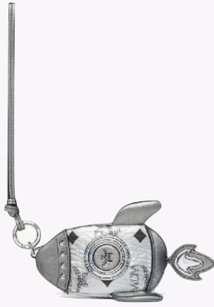
AREN ROCKET POUCH CHARM IN VISETOS