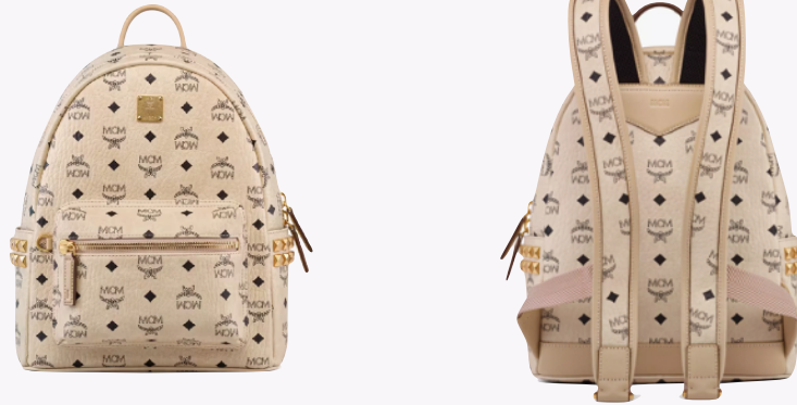
STARK SIDE STUDS BACKPACK IN VISETOS (SMALL)