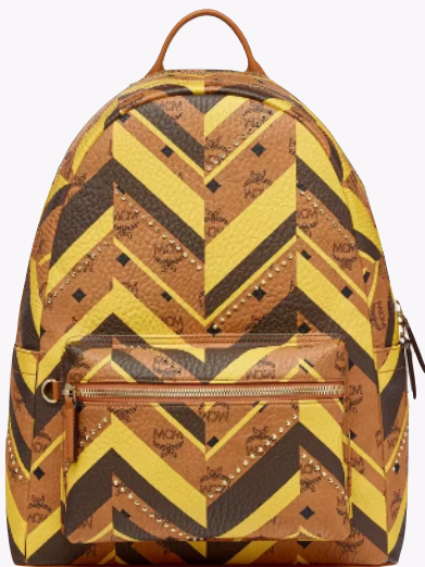
STUDED STARK BACKPACK IN MEGA HERRINGBONE VISETOS