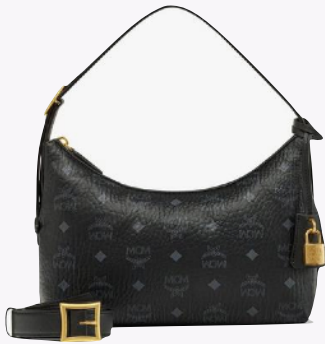
AREN HOBO IN VISETOS