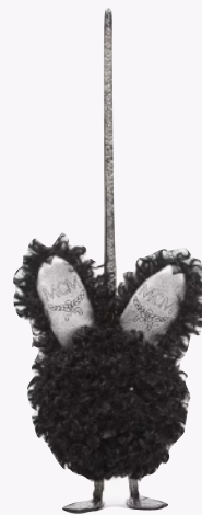
AREN RABBIT CHARM IN FAUX FUR