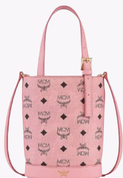
AREN BUCKET TOTE IN VISETOS (MINI) THB 26,200 / NOW THB 15,720