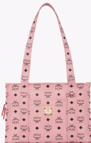
AREN SCHOOL BAG TOTE IN VISETOS (SMALL) THB 29,500 / NOW THB 17,700