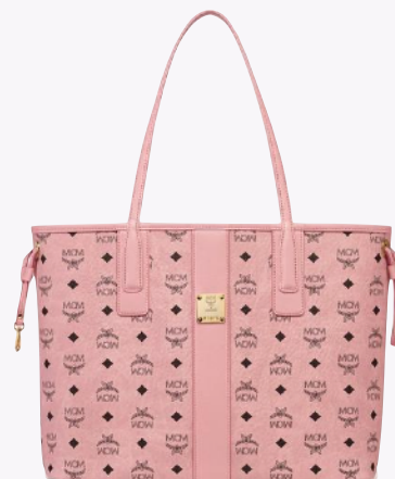
REVERSIBLE LIZ SHOPPER IN VISETOS (MEDIUM) THB 30,300 / NOW THB 18,180