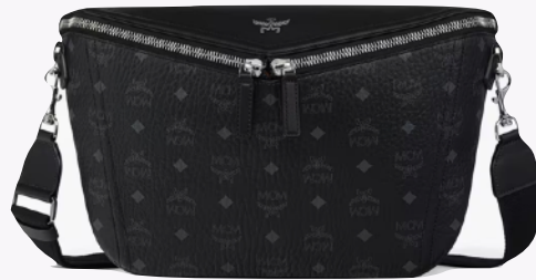
DIAMANT 3D CROSSBODY IN VISETOS LEATHER MIX (MEDIUM)