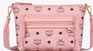
AREN CROSSBODY IN VISETOS (SMALL) THB 22,500 / NOW THB 13,500