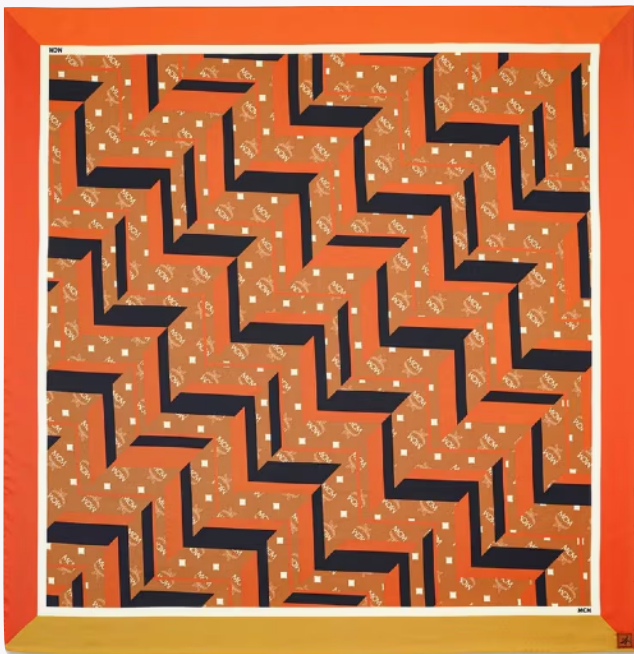
MEGA HERRINGBONE PRINT SCARF IN ORGANIC SILK