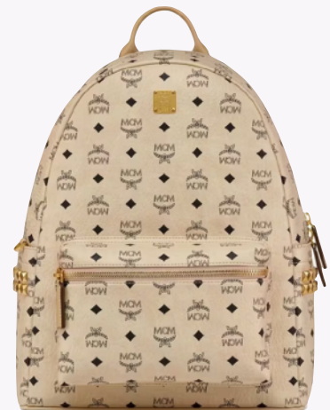
STARK SIDE STUDS BACKPACK IN VISETOS (MEDIUM) THB 49,800 / NOW THB 34,860