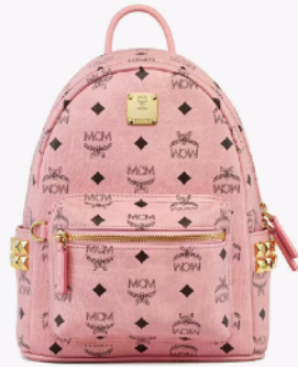
STARK SIDE STUDS BACKPACK IN VISETOS (MINI) THB 42,300 / NOW THB 29,610