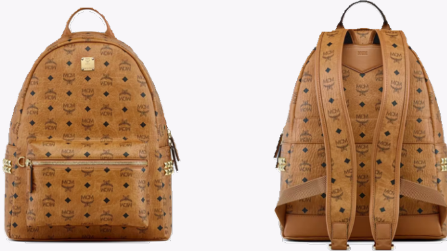
STARK SIDE STUDS BACKPACK IN VISETOS (MEDIUM) THB 51,500 / NOW THB 30,900