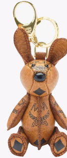
MCM PARK RABBIT CHARM IN VISETOS