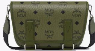
AREN MESSENGER IN VISETOS THB 28,600 / NOW THB 17,160