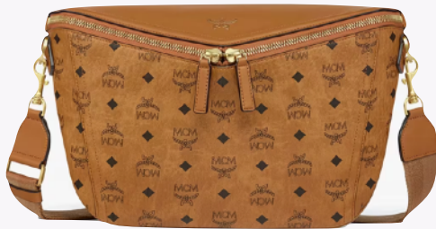
DIAMANT 3D CROSSBODY IN VISETOS LEATHER MIX (MEDIUM)