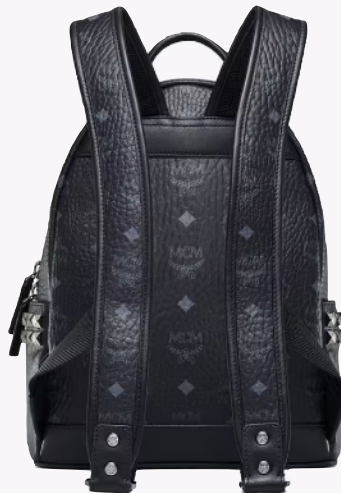
STARK SIDE STUDS BACKPACK IN VISETOS (SMALL) THB 42,800 / NOW THB 29,960