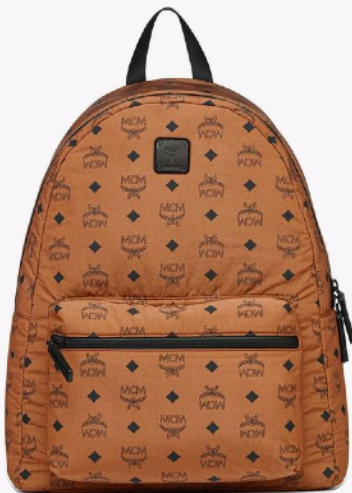
STARK PACKABLE BACKPACK IN MONOGRAM NYLON (MEDIUM) THB 24,500 / NOW THB 14,700