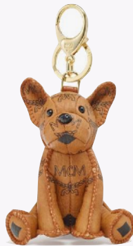
MCM M PUP CHARM IN VISETOS