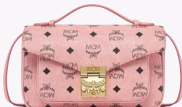
TRACY CROSSBODY IN VISETOS (MEDIUM) THB 35,100 / NOW THB 21,060