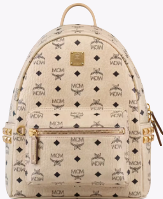
STARK SIDE STUDS BACKPACK IN VISETOS (SMALL) THB 44,100 / NOW THB 30,870