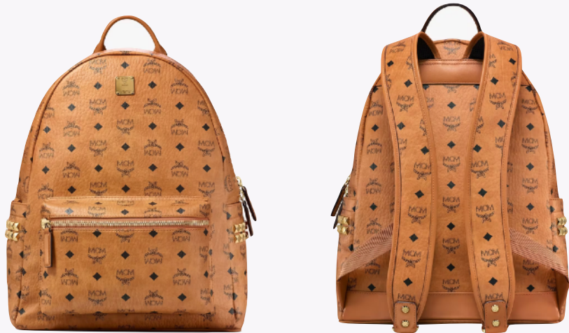
STARK SIDE STUDS BACKPACK IN VISETOS (MEDIUM)