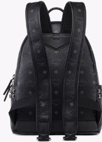
STARK SIDE STUDS BACKPACK IN VISETOS (SMALL) THB 44,100 / NOW THB 30,870