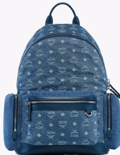
STARK BACKPACK IN MONOGRAM DENIM JACQUARD (MEDIUM) THB 51,500 / NOW THB 30,900