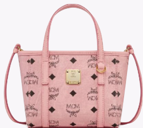
TONI TOP-ZIP SHOPPER IN VISETOS (X-MINI) THB 23,500 / NOW THB 14,100