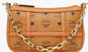
AREN SHOULDER BAG IN VISETOS (MINI) THB 22,900