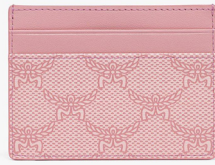
HIMMEL CARD CASE IN LAURETOS