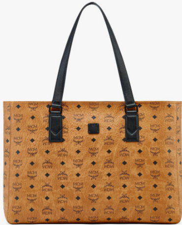
AREN TOTE IN VISETOS