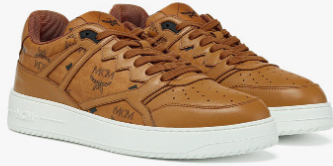
NEO TERRAIN LO SNEAKERS IN VISETOS SIZE : 41,42,43 THB 18,500