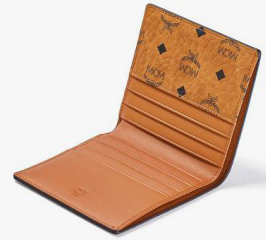
MINI BIFOLD CARD WALLET