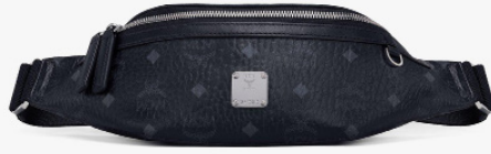
FURSTEN BELT BAG IN VISETOS (SMALL) THB 20,500