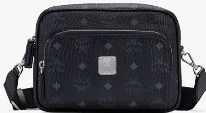
AREN CROSSBODY IN VISETOS (SMALL) THB 27,000