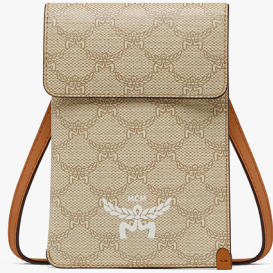
HIMMEL CROSSBODY POUCH IN LAURETOS