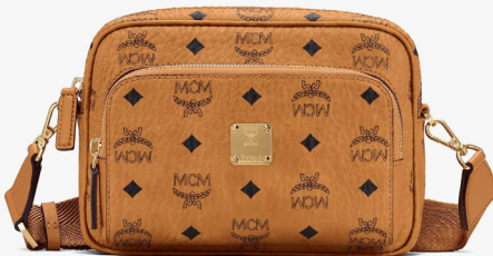
AREN CROSSBODY IN VISETOS (SMALL) THB 27,700