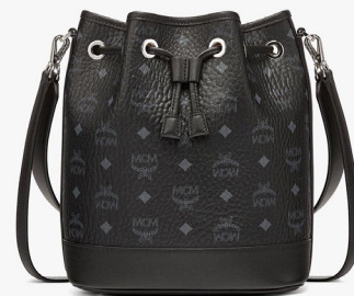
DESSAU DRAWSTRING BAG IN VISETOS (MEDIUM) THB 35,400