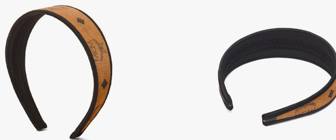
HEADBAND IN VISETOS