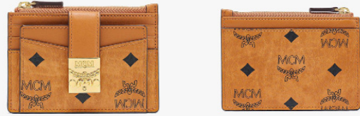
TRACY ZIP CARD CASE IN VISETOS