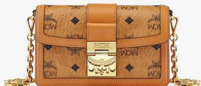
TRACY CROSSBODY IN VISETOS (MINI) THB 22,900