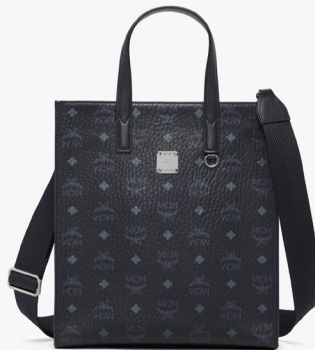
AREN TOTE IN VISETOS (SMALL) THB 27,500