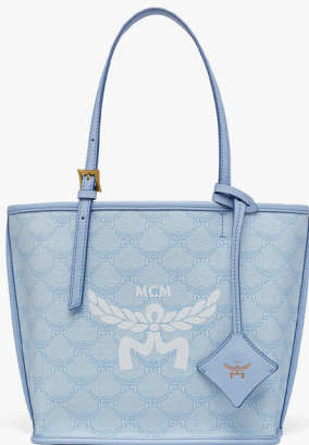
HIMMEL SHOPPER IN LAURETOS (MINI)