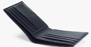
BIFOLD WALLET POCKET IN VISETOS ORIGINAL