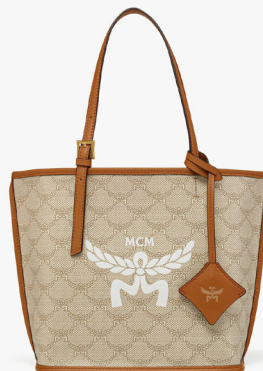
HIMMEL SHOPPER IN LAURETOS (MINI) THB 22,500