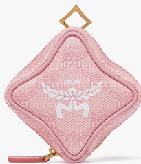
HIMMEL ZIP POUCH CHARM IN LAURETOS