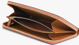
LARGE ZIP WALLET