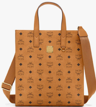
AREN TOTE IN VISETOS (SMALL) THB 27,500