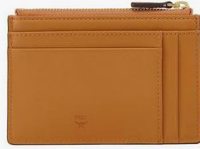
AREN ZIP CARD CASE IN VISETOS IN VISETOS