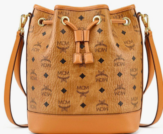
DESSAU DRAWSTRING BAG IN VISETOS (MEDIUM) THB 35,400