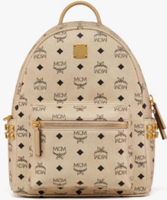
STARK SIDE STUDS BACKPACK IN VISETOS (SMALL) THB 38,400