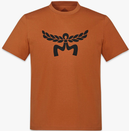
LAUREL LOGO PRINT T-SHIRT IN ORGANIC COTTON SIZE : M,L,XL THB 9,100