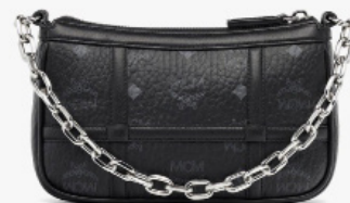
AREN SHOULDER BAG IN VISETOS (MINI) THB 22,900