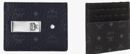
MONEY CLIP CARD CASE