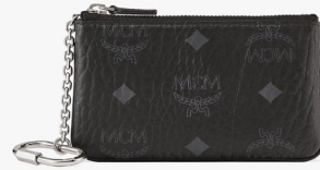
KEY POUCH IN VISETOS ORIGINAL