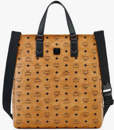
AREN TOTE IN VISETOS