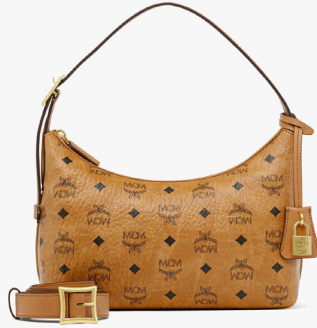
AREN HOBO IN VISETOS (SMALL) THB 29,700