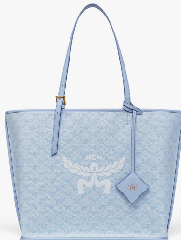
HIMMEL SHOPPER IN LAURETOS (MEDIUM)