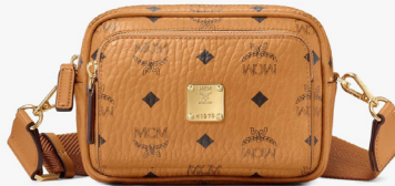
AREN CROSSBODY IN VISETOS (X-MINI) THB 25,900