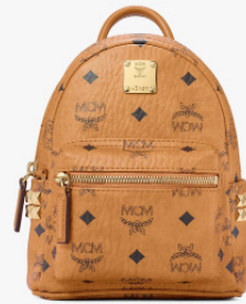
STARK BACKPACK (X-MINI : 20 CM.)