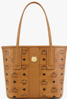
REVERSIBLE LIZ SHOPPER IN VISETOS (MINI) THB 23,000