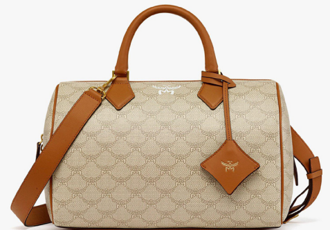
ELLA BOSTON BAG IN LAURETOS (MEDIUM) THB 28,000