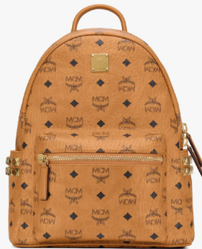
STARK SIDE STUDS BACKPACK (SMALL 32 CM.)