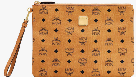
WRISTLET ZIP POUCH IN VISETOS ORIGINAL THB 15,700