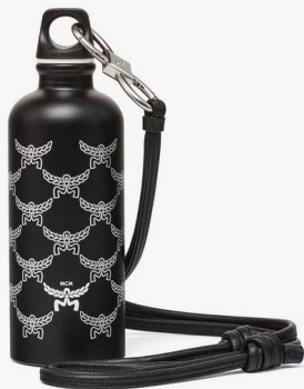
MCM X SIGG TRAVELLER BOTTLE WITH LEATHER STRAP