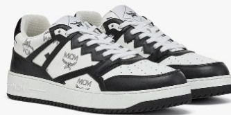
NEO TERRAIN LO SNEAKERS IN VISETOS SIZE : 41,42,43 THB 18,500