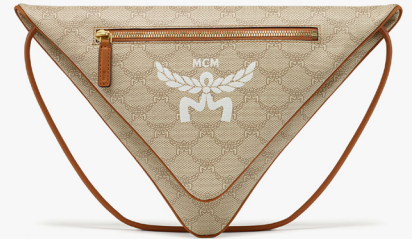
HIMMEL TRIANGLE POUCH IN LAURETOS