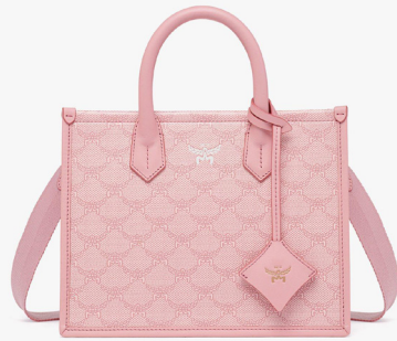
HIMMEL TOTE IN LAURETOS (SMALL)