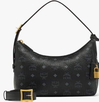
AREN HOBO IN VISETOS (SMALL) THB 29,700