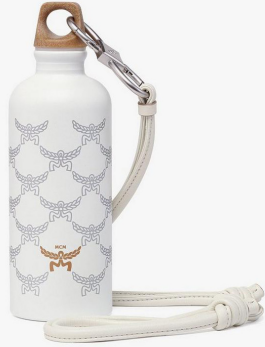
MCM X SIGG TRAVELLER BOTTLE WITH LEATHER STRAP