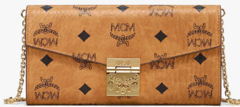
TRACY CROSSBODY WALLET IN VISETOS