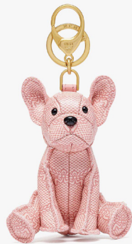
HIMMEL FRENCH BULLDOG CHARM HIMMEL FRENCH BULLDOG CHARM