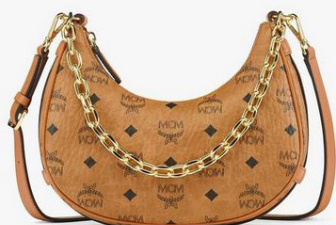
AREN CRESCENT HOBO IN VISETOS (MINI) THB 29,500