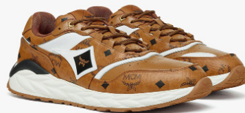
SKYWANDER LO SNEAKERS IN VISETOS SIZE : 41,42,43,44 THB 22,300