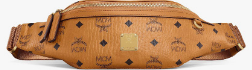
FURSTEN BELT BAG IN VISETOS (MEDIUM) THB 24,100