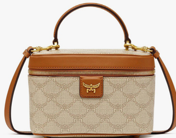
HIMMEL VANITY CASE IN LAURETOS