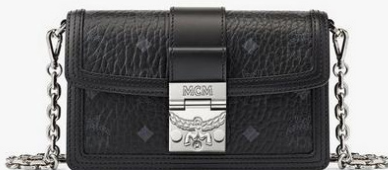
TRACY CROSSBODY IN VISETOS (MINI) THB 22,900