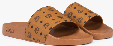
MONOGRAM PRINT RUBBER SLIDES SIZE : 36,37,38,39 THB 7,900