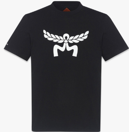
LAUREL LOGO PRINT T-SHIRT IN ORGANIC COTTON SIZE : M,L,XL THB 9,100