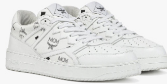
NEO TERRAIN LO SNEAKERS IN VISETOS SIZE : 41,42,43 THB 18,500