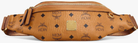
FURSTEN BELT BAG IN VISETOS (SMALL) THB 20,500