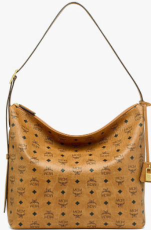
AREN HOBO IN VISETOS (LARGE) THB 33,500