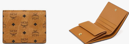
AREN SNAP WALLET WITH COIN POCKET