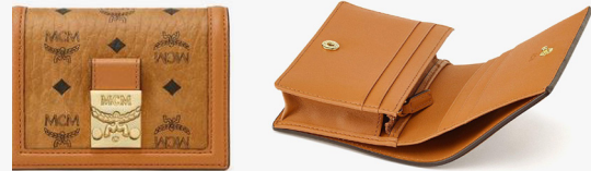
MINI TRACY WALLET IN VISETOS