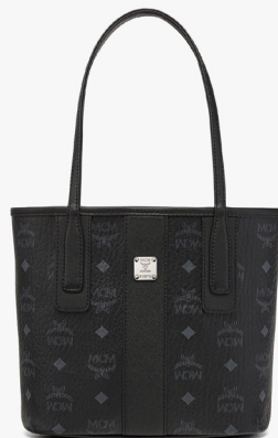
REVERSIBLE LIZ SHOPPER IN VISETOS (MINI) THB 23,000