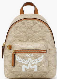
STARK BEBE BOO BACKPACK IN LAURETOS