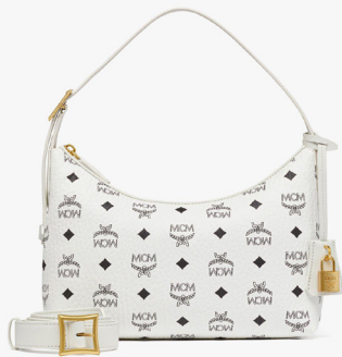
AREN HOBO IN VISETOS (SMALL) THB 29,700