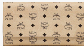
AREN TRIFOLD WALLET IN VISETOS THB 15,700