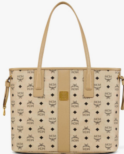
REVERSIBLE LIZ SHOPPER IN VISETOS THB 26,600