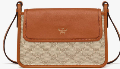
HIMMEL CROSSBODY IN LAURETOS