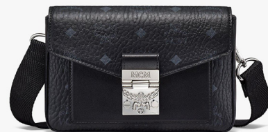
VIKTOR CROSSBODY IN VISETOS (SMALL) THB 29,100