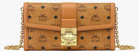
TRACY CHAIN WALLET IN VISETOS