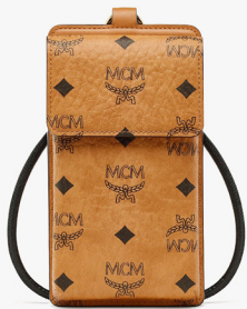
LANYARD PHONE CASE IN VISETOS