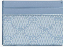
HIMMEL CARD CASE IN LAURETOS