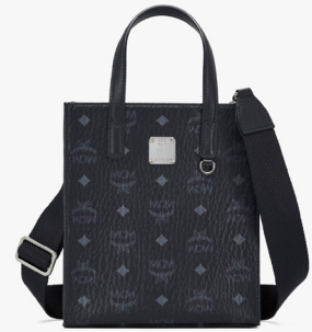
AREN TOTE IN VISETOS (MINI) THB 25,900