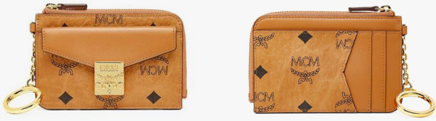
TRACY ZIP CARD CASE IN VISETOS