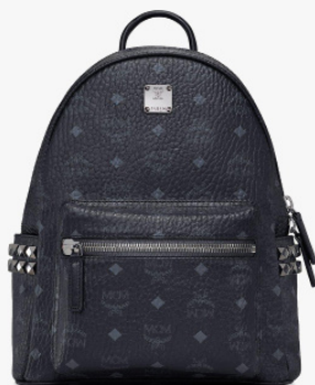
STARK BACKPACK (SMALL 32 CM.)