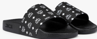
MONOGRAM PRINT RUBBER SLIDES SIZE : 36,37,38,39,41 THB 7,900