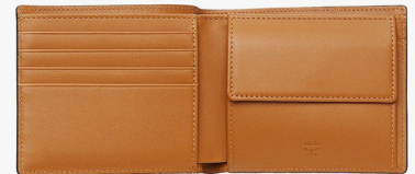
BIFOLD WALLET W/COIN POCKET IN VISETOS ORIGINAL