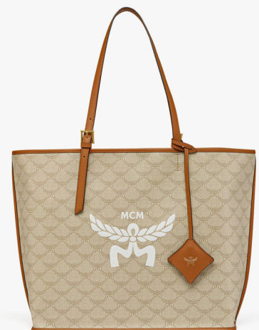
HIMMEL SHOPPER IN LAURETOS (MEDIUM) THB 24,000