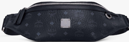
FURSTEN BELT BAG IN VISETOS (MEDIUM) THB 24,100