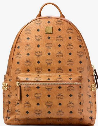
STARK BACKPACK (MEDIUM 41 CM.)