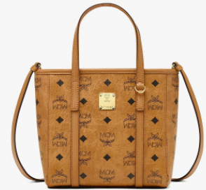
MINI AREN TOP-ZIP SHOPPER IN VISETOS (MINI) THB 23,000