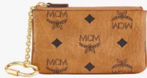
KEY POUCH IN VISETOS ORIGINAL