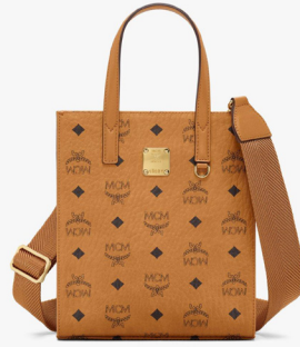
AREN TOTE IN VISETOS (MINI) THB 25,900