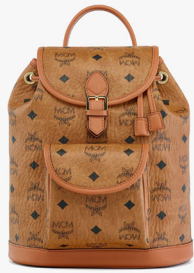
AREN DRAWSTRING BACKPACK IN VISETOS