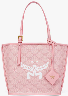
HIMMEL SHOPPER IN LAURETOS (MINI)