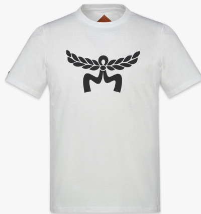
LAUREL LOGO PRINT T-SHIRT IN ORGANIC COTTON SIZE : M,L THB 9,100