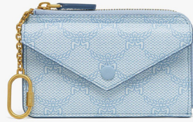
HIMMEL ZIP-AROUND CARD CASE IN LAURETOS