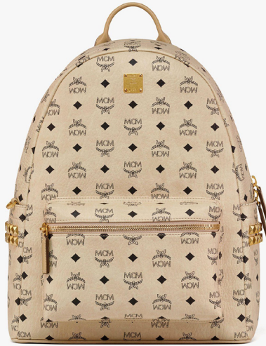
STARK SIDE STUDS BACKPACK IN VISETOS (MEDIUM) THB 44,400