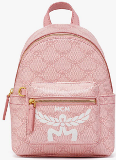
STARK BEBE BOO BACKPACK IN LAURETOS