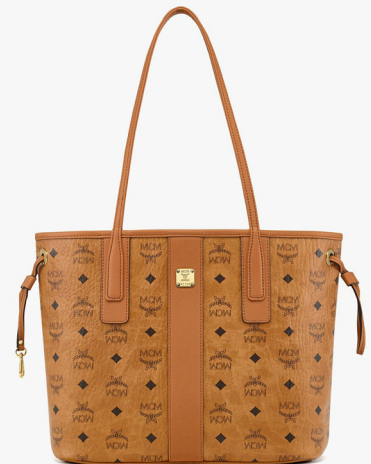
REVERSIBLE LIZ SHOPPER IN VISETOS (SMALL) THB 24,300