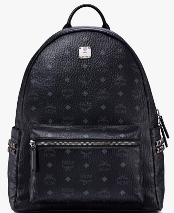
STARK BACKPACK (MEDIUM 41 CM.)