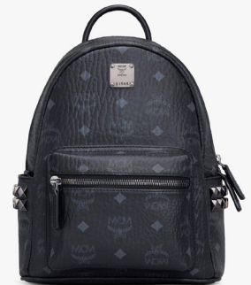
STARK BACKPACK (MINI : 27 CM.)