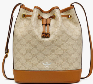
HIMMEL DRAWSTRING BAG IN LAURETOS