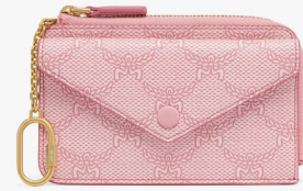
HIMMEL ZIP-AROUND CARD CASE IN LAURETOS