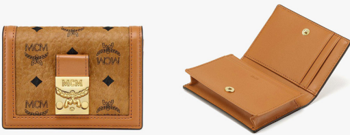
TRACY CARD HOLDER IN VISETOS