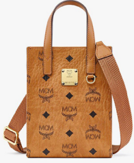
AREN TOTE IN VISETOS (X-MINI) THB 22,900