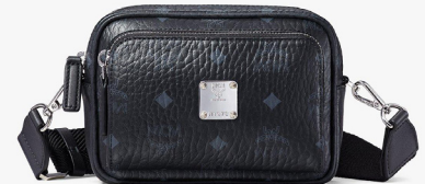
AREN CROSSBODY IN VISETOS (X-MINI) THB 25,900