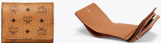
MINI TRIFOLD WALLET IN VISETOS