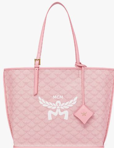
HIMMEL SHOPPER IN LAURETOS (MEDIUM)