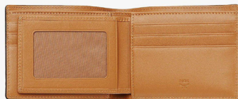
BIFOLD WALLET WITH CARD CASE