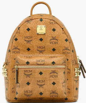
STARK BACKPACK (MINI : 27 CM.)