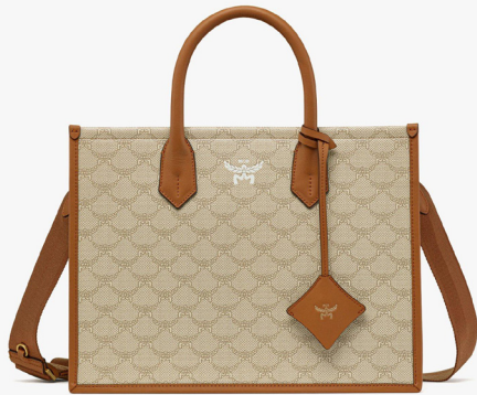
HIMMEL TOTE IN LAURETOS (MEDIUM) THB 33,500