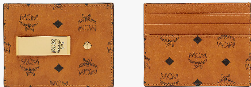
MONEY CLIP CARD CASE