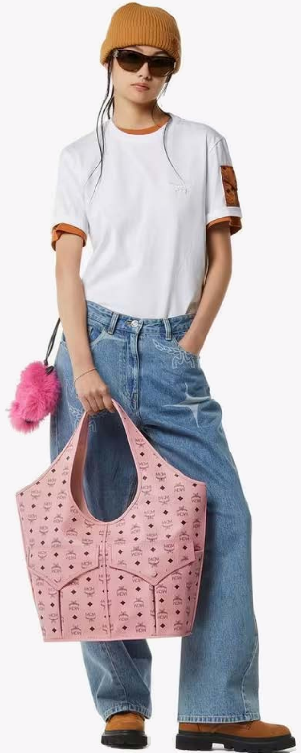
LENI SHOPPER IN VIETOS THB 37,800