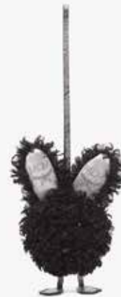
AREN RABBIT CHARM IN FAUX FUR