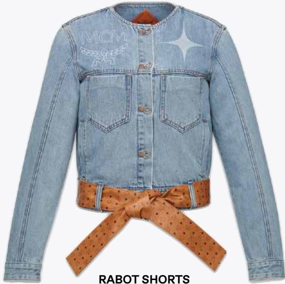
RABOT SHORTS SIZE 40,42,44 THB 35,000