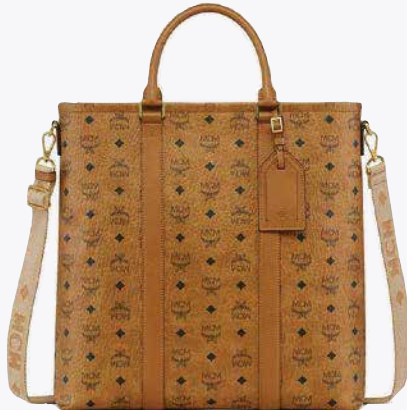
AREN TOTE IN VISETOS (LARGE) THB 35,000