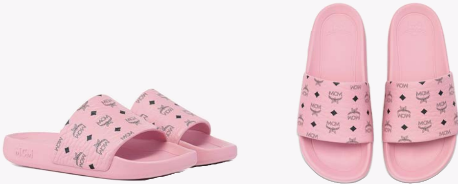
MONOGRAM PRINT RUBBER SLIDES SIZE : 37,38 THB 9,400