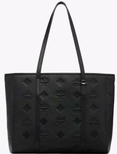
TONI TOP-ZIP SHOPPER IN MAXI MONOGRAM LEATHER (MEDIUM)