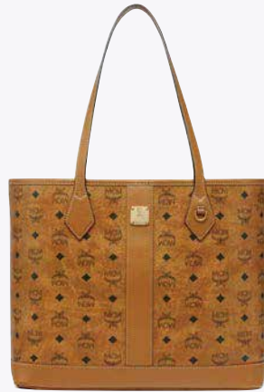
NEW LIZ SHOPPER IN VISETOS (MEDIUM) THB 30,300