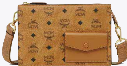
AREN STANDING CROSSBODY POUCH IN VISETOS (SMALL) THB 27,600