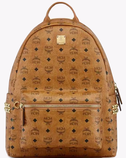
STARK SIDE STUDS BACKPACK IN VISETOS (MEDIUM : 41 CM.) THB 51,500