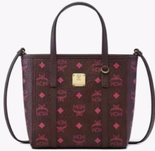
TONI TOP-ZIP SHOPPER IN VISETOS (MINI) THB 26,200