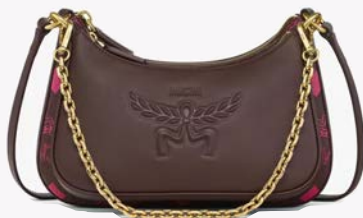
AREN DUO HOBO IN MAXI VISETOS AND CALFSKIN THB 35,200