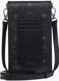
AREN PHONE WALLET IN VISETOS