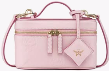
AREN EAST WEST SHOULDER BAG IN MAXI MONOGRAM LEATHER