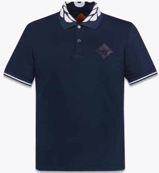
LAUREL PIQUÉ POLO