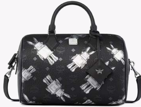
ELLA BOSTON BAG IN RABOT VISETOS (MEDIUM) THB 40,700