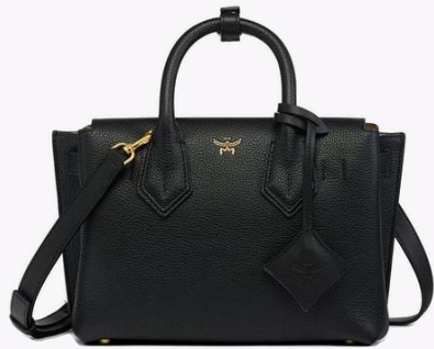
MILLA TOTE IN GRAINED LEATHER (SMALL)