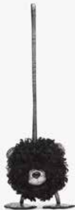
AREN BEAR CHARM IN FAUX FUR