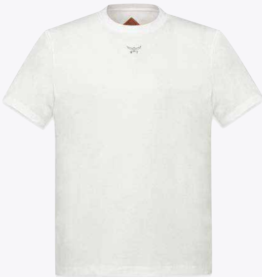
ESSENTIAL LOGO PRINT T-SHIRT IN ORGANIC COTTON