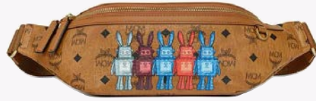
FURSTEN BELT BAG IN RABOT VISETOS THB 30,300