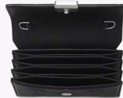
AREN CHAIN WALLET IN EMBOSSED MONOGRAM LEATHER