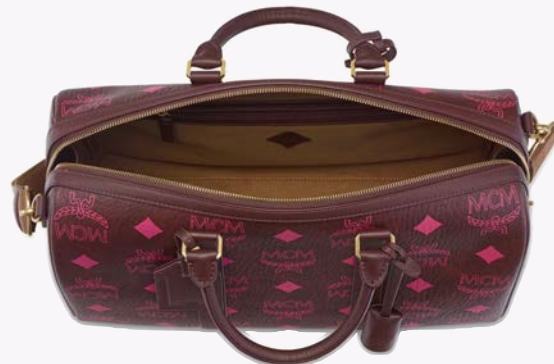
OTTOMAR WEEKENDER BAG IN MAXI VISETOS