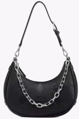
AREN CRESCENT HOBO BAG IN MAXI MONOGRAM LEATHER