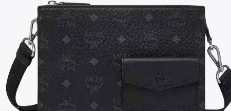
AREN STANDING CROSSBODY POUCH IN VISETOS (SMALL) THB 27,600