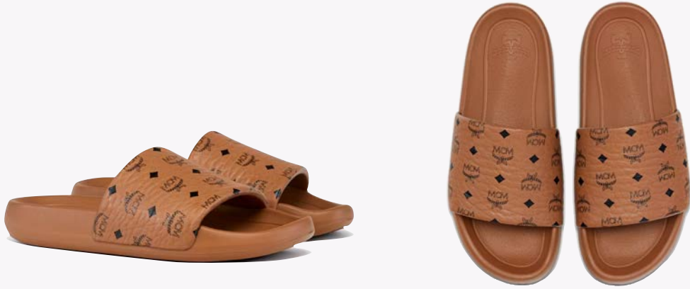
MONOGRAM PRINT RUBBER SLIDES SIZE 36,37,38,39,40,41,42,43,44,45 THB 9,000