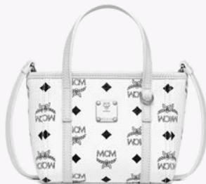
TONI TOP-ZIP SHOPPER IN VISETOS (X-MINI) THB 23,500