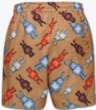
RABOT SHORTS SIZE 46,48 THB 17,400