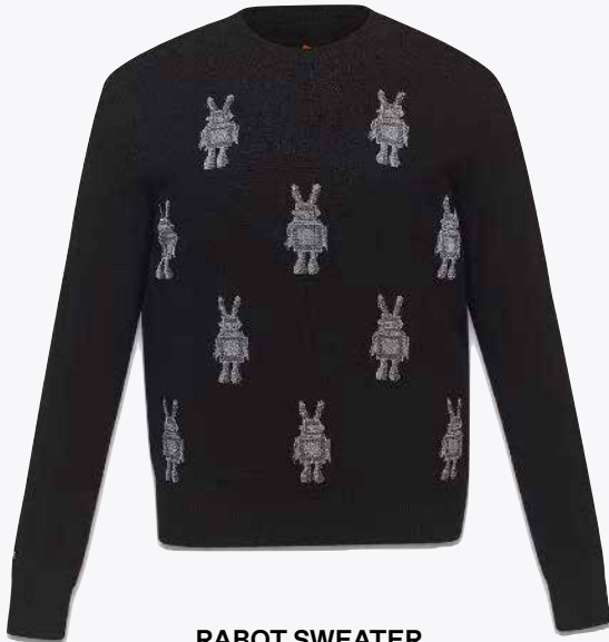
RABOT SWEATER IN WOOL JACQUARD