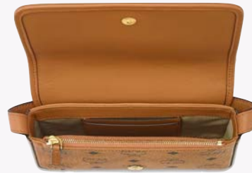
AREN PHONE LANYARD IN VISETOS