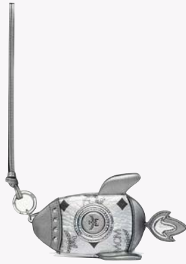
AREN ROCKET POUCH CHARM IN VISETOS THB 12,300