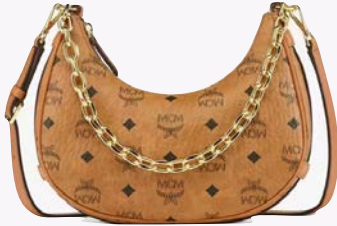
AREN CRESCENT HOBO BAG IN VISETOS