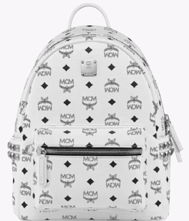
STARK SIDE STUDS BACKPACK IN VISETOS (SMALL : 32 CM.) THB 44,100