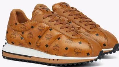
DIAMANTE SNEAKERS IN QUILTED MONOGRAM LEATHER