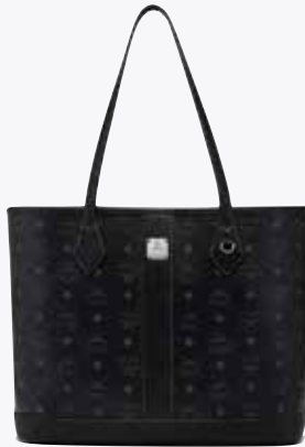
NEW LIZ SHOPPER IN VISETOS (SMALL) THB 28,100