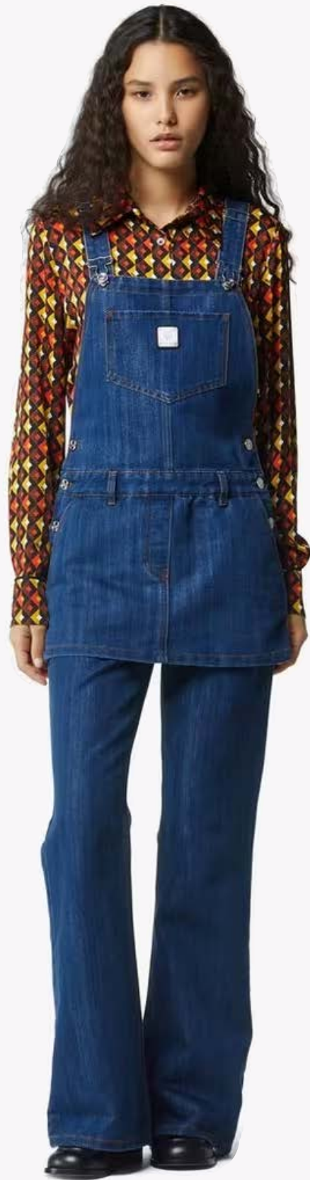
OVERALL SKIRT IN LUREX DENIM SIZE : S,M THB 22,700