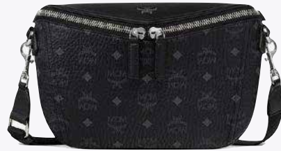
DIAMANT 3D CROSSBODY IN VISETOS (SMALL) THB 31,300