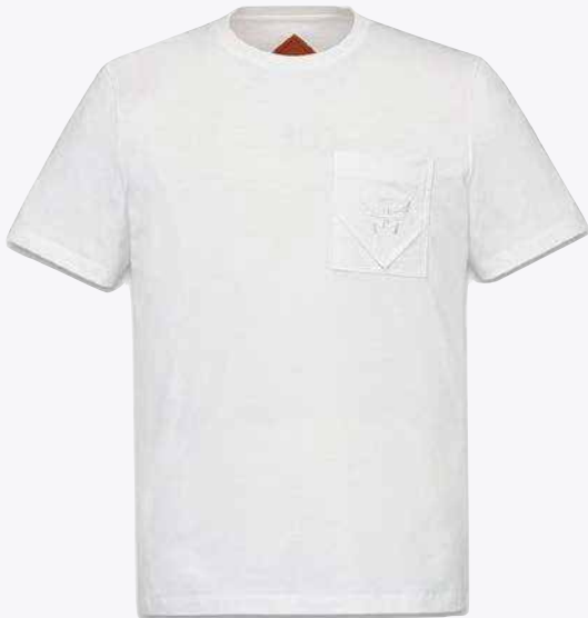
ESSENTIAL LOGO POCKET T-SHIRT IN ORGANIC COTTON