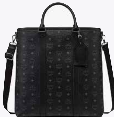
AREN TOTE IN VISETOS (LARGE) THB 35,000