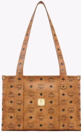
AREN SCHOOL BAG TOTE IN VISETOS (SMALL) THB 29,500