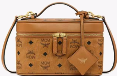
AREN VANITY CASE IN VISETOS LEATHER MIX (SMALL) THB 28,800