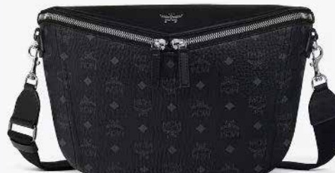
DIAMANT 3D CROSSBODY IN VISETOS LEATHER MIX (MEDIUM) THB 35,000