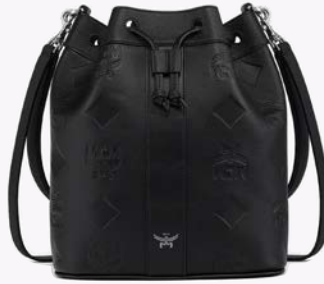
DESSAU DRAWSTRING BAG IN MAXI MONOGRAM LEATHER