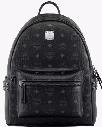
STARK SIDE STUDS BACKPACK IN VISETOS (SMALL : 32 CM.) THB 44,100