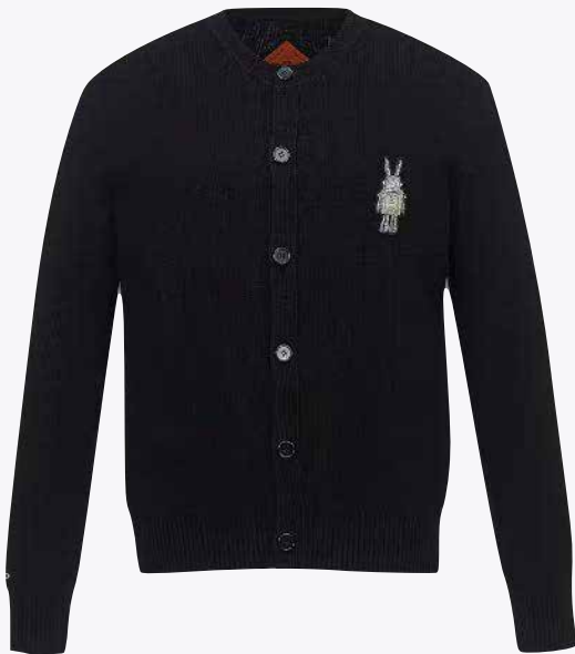
RABOT PATCH WOOL KNIT CARDIGAN