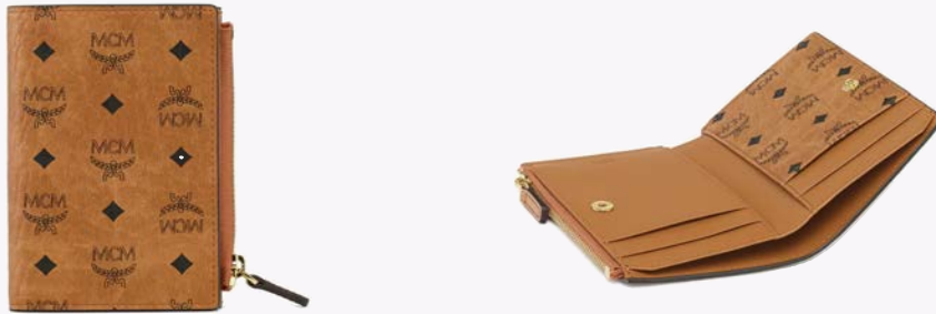
BIFOLD ZIP CARD WALLET IN VISETOS ORIGINAL