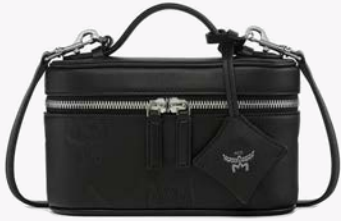
AREN EAST WEST SHOULDER BAG IN MAXI MONOGRAM LEATHER