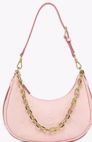
AREN CRESCENT HOBO BAG IN MAXI MONOGRAM LEATHER