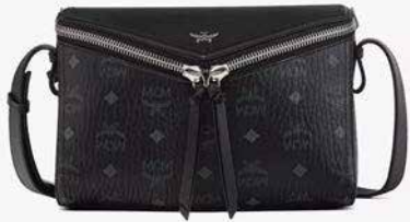
DIAMOND 3D SHOULDER IN VISETOS LEATHER MIX (SMALL) THB 38,900