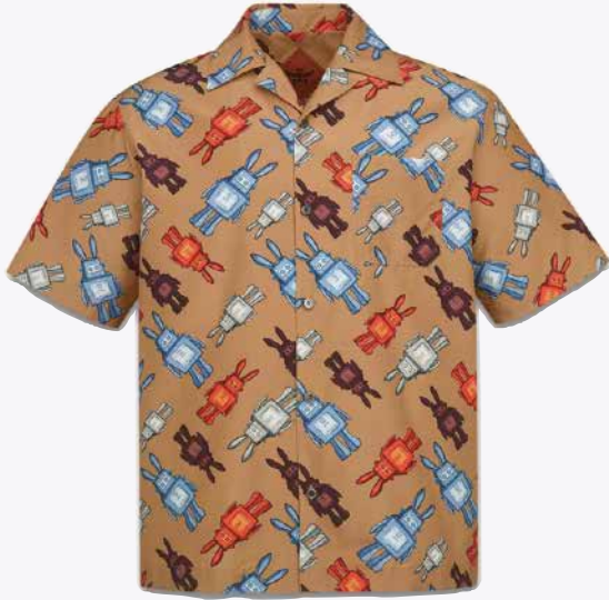
RABOT SHORTS SIZE 46,48 THB 22,200