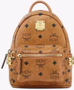
STARK SIDE STUDS BACKPACK IN VISETOS (X-MINI : 20 CM.) THB 37,500