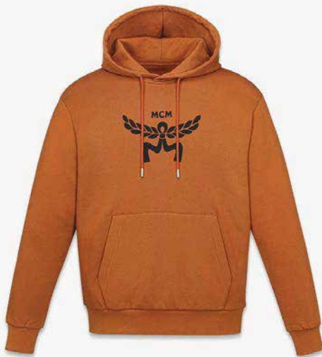
CLASSIC LOGO HOODIE IN ORGANIC COTTON SIZE : S,M,L,XL THB 19,000