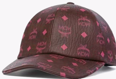
CLASSIC CAP IN VISETOS