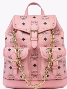
AREN DRAWSTRING BACKPACK IN VISETOS (MINI)