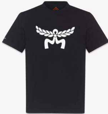
LAUREL LOGO PRINT T-SHIRT IN ORGANIC COTTON SIZE :S,M,L,XL THB 11,000