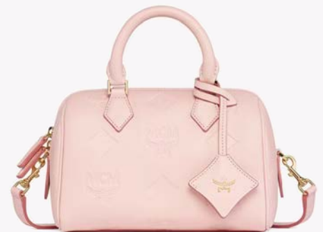
ELLA BOSTON BAG IN MAXI MONOGRAM LEATHER (SMALL)