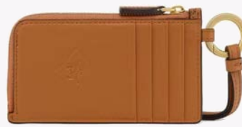
AREN CARD POUCH IN VISETOS THB 12,300