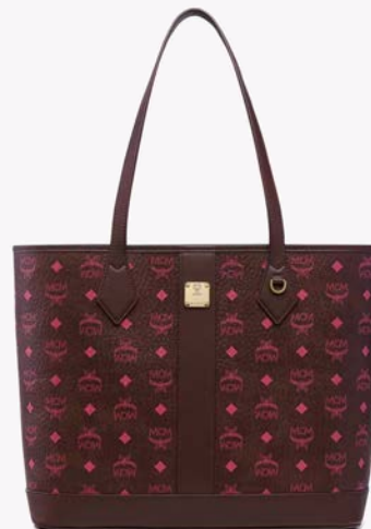
NEW LIZ SHOPPER IN VISETOS (MEDIUM) THB 30,300