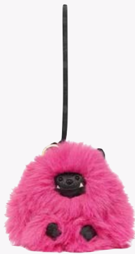
AREN MARSDOG CHARM IN FAUX FUR VISETOS THB 11,200