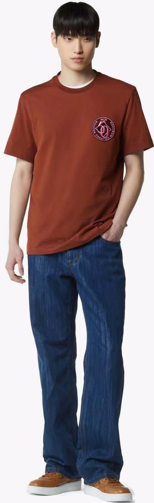
50TH ANNIVERSARY T-SHIRT SIZE : M,L THB 11,200