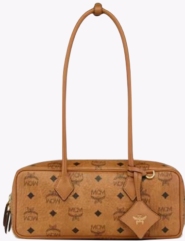
AREN SHOULDER BAG IN VISETOS (SMALL) THB 25,800