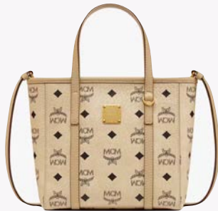
TONI TOP-ZIP SHOPPER IN VISETOS (MINI) THB 26,200