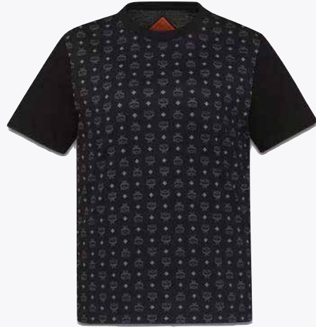
MONOGRAM PRINT T-SHIRT IN ORGANIC COTTON