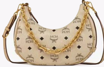
AREN CRESCENT HOBO BAG IN VISETOS