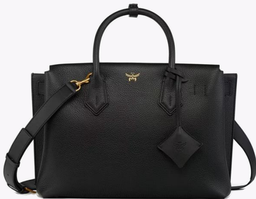
MILLA TOTE IN GRAINED LEATHER (MEDIUM)