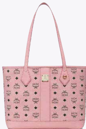
NEW LIZ SHOPPER IN VISETOS (SMALL) THB 28,100