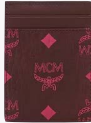
AREN CARD CASE IN VISETOS THB 8,500