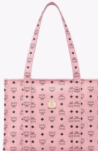
AREN SCHOOL BAG TOTE IN VISETOS (MEDIUM) THB 33,200