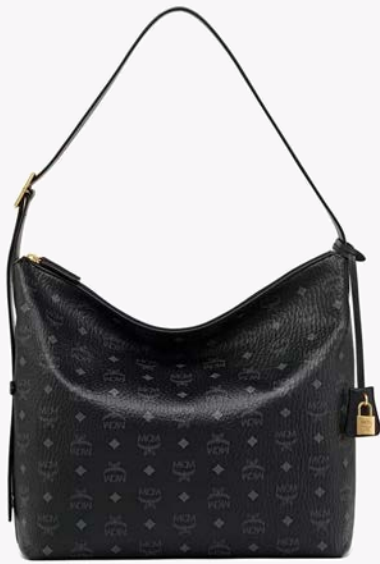
AREN HOBO IN VISETOS THB 38,600