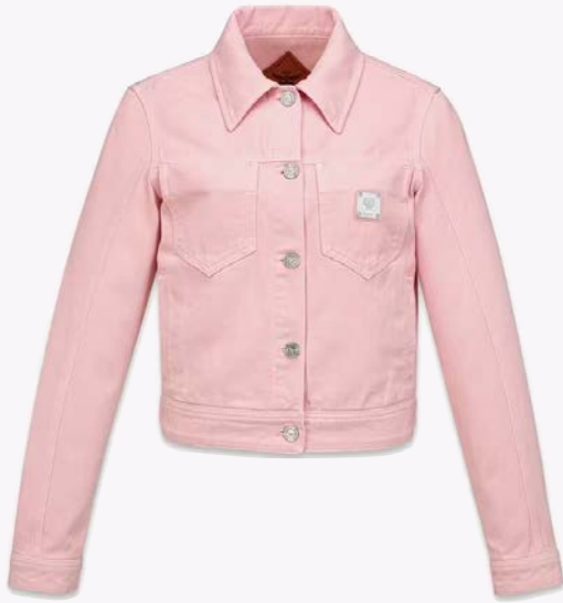
WASHED DENIM JACKET SIZE : 40,42 THB 31,300