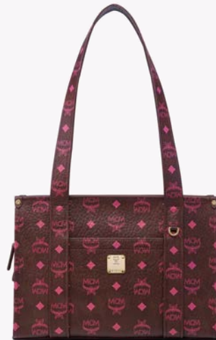
AREN SCHOOL BAG TOTE IN VISETOS (SMALL) THB 29,500