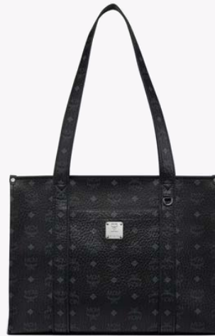
AREN SCHOOL BAG TOTE IN VISETOS (MEDIUM) THB 33,200