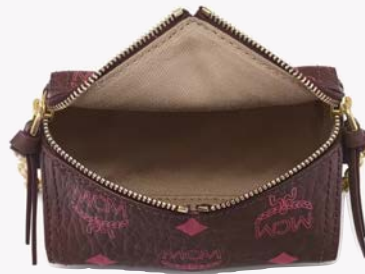
DIAMANT 3D CHARM IN VISETOS THB 13,800