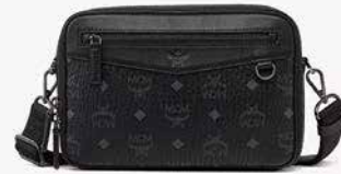
DIAMOND CAMERA BAG IN VISETOS (SMALL) THB 31,300