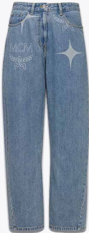
CONSTELLATION DENIM JEANS SIZE 38,40 THB 20,400