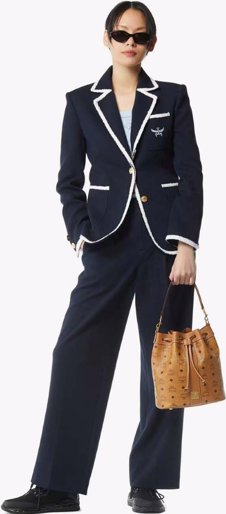
DESSAU DRAWSTRING BAG IN VISETOS (MEDIUM)