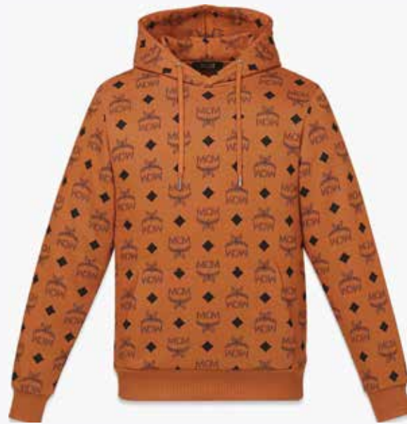
MONOGRAM RIPSTOP NYLON PARKA