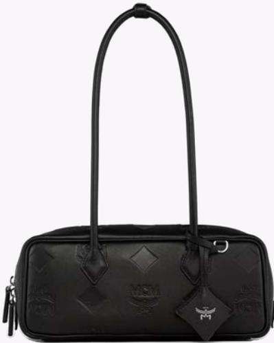
AREN EAST WEST SHOULDER BAG IN MAXI MONOGRAM LEATHER