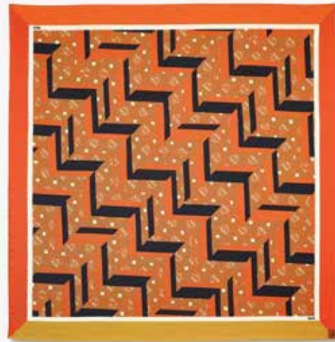
MONOGRAM SHAWL IN WOOL-SILK JACQUARD