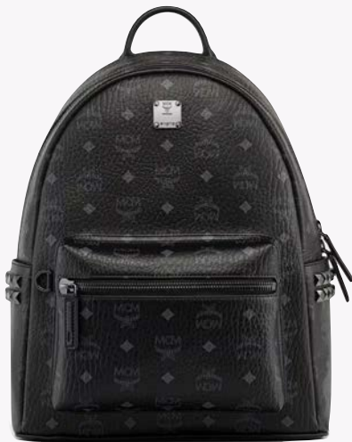
STARK SIDE STUDS BACKPACK IN VISETOS (SMALL-MEDIUM : 38 CM.) THB 47,800