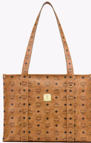
AREN SCHOOL BAG TOTE IN VISETOS (MEDIUM) THB 33,200