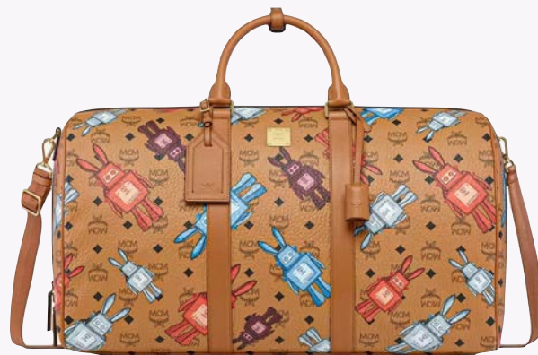
ZOTTOMAR WEEKENDER BAG IN RABOT VISETOS (X-LARGE) THB 64,300