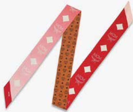
MONOGRAM PRINT IN PETITE SCARF