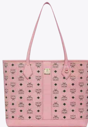
NEW LIZ SHOPPER IN VISETOS (MEDIUM) THB 30,300