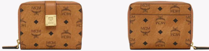
AREN BRASS PLATE WALLET IN VISETOS