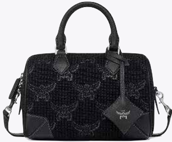
ELLA BOSTON BAG IN LAURETOS (SMALL) THB 30,300