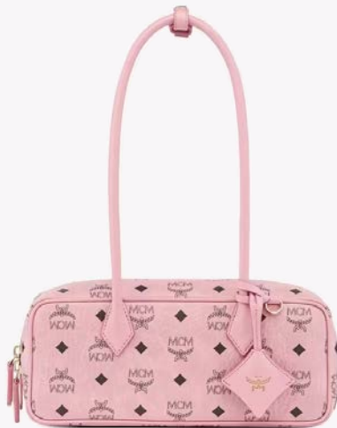
AREN SHOULDER BAG IN VISETOS (SMALL) THB 25,800