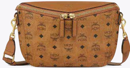
DIAMANT 3D CROSSBODY IN VISETOS (SMALL) THB 31,300