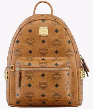
STARK SIDE STUDS BACKPACK IN VISETOS (MINI : 27 CM.) THB 42,300