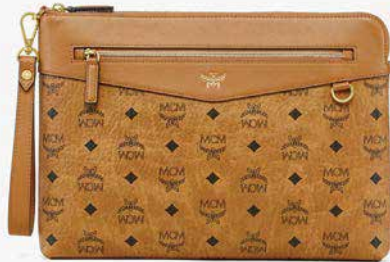
DIAMOND WRISTLET POUCH IN VISETOS (MEDIUM) THB 21,700