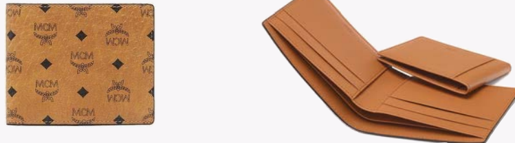
BIFOLD WALLET IN VISETOS WITH CARD CASE