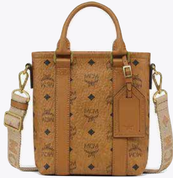
AREN TOTE IN VISETOS (MINI) THB 27,700