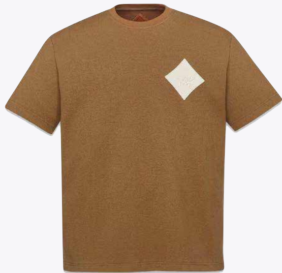
LOGO PATCH BOUCLÉ T-SHIRT