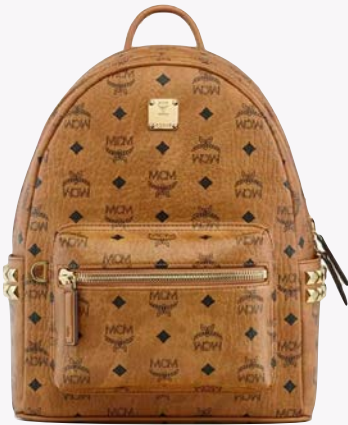
STARK SIDE STUDS BACKPACK IN VISETOS (SMALL : 32 CM.) THB 44,100