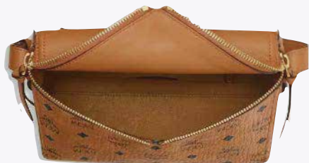
DIAMANT 3D SHOULDER BAG IN VISETOS