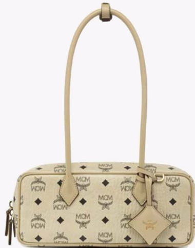
AREN SHOULDER BAG IN VISETOS (SMALL) THB 25,800