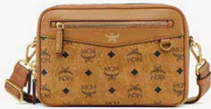
DIAMOND CAMERA BAG IN VISETOS (SMALL) THB 31,300