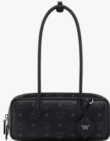
AREN SHOULDER BAG IN VISETOS (SMALL) THB 25,800