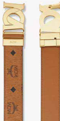
M-ART REVERSIBLE BELT 1.5" IN VISETOS