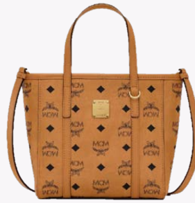
TONI TOP-ZIP SHOPPER IN VISETOS (MINI) THB 26,200