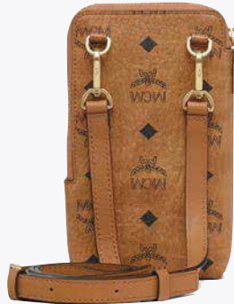
AREN PHONE POUCH IN VISETOS (MINI) THB 16,000