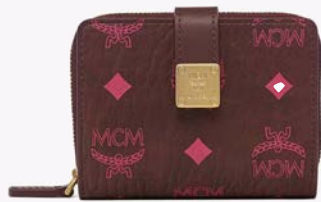
AREN BRASS PLATE WALLET IN VISETOS THB 14,200