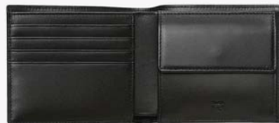
BIFOLD WALLET WITH COIN POCKET IN VISETOS ORIGINAL