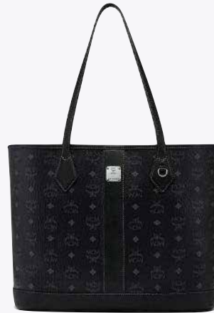
NEW LIZ SHOPPER IN VISETOS (MEDIUM) THB 30,300