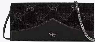
DIAMOND CLUTCH IN LAURETOS (SMALL) THB 31,300