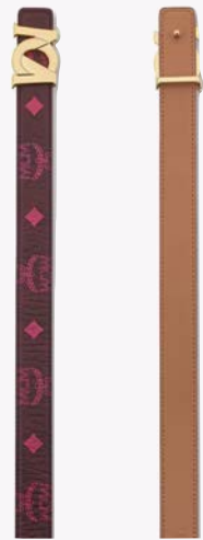
M-ART BELT 1" IN VISETOS THB 13,800