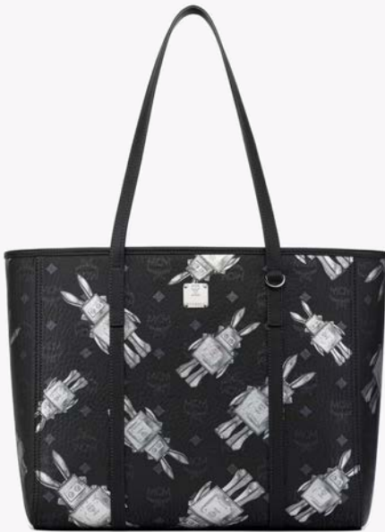
TONI TOP-ZIP SHOPPER IN RABOT VISETOS (MEDIUM) THB 32,200