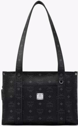
AREN SCHOOL BAG TOTE IN VISETOS (SMALL) THB 29,500