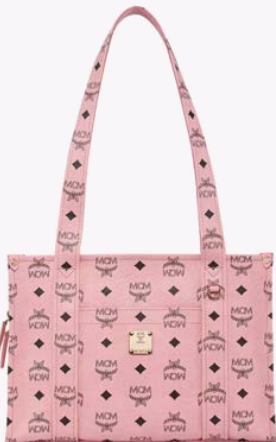
AREN SCHOOL BAG TOTE IN VISETOS (SMALL) THB 29,500