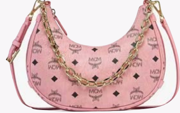
AREN CRESCENT HOBO BAG IN VISETOS