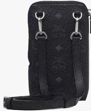
AREN PHONE POUCH IN VISETOS (MINI) THB 16,000