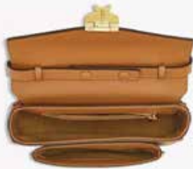
TRACY CROSSBODY IN VISETOS