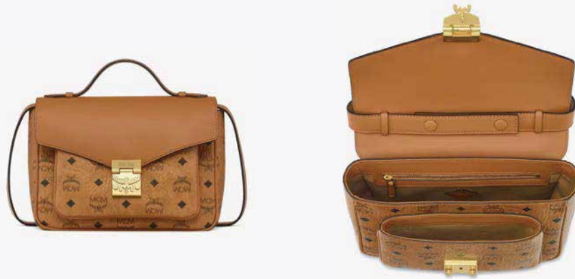
TRACY SATCHEL IN VISETOS LEATHER MIX (SMALL) THB 44,100