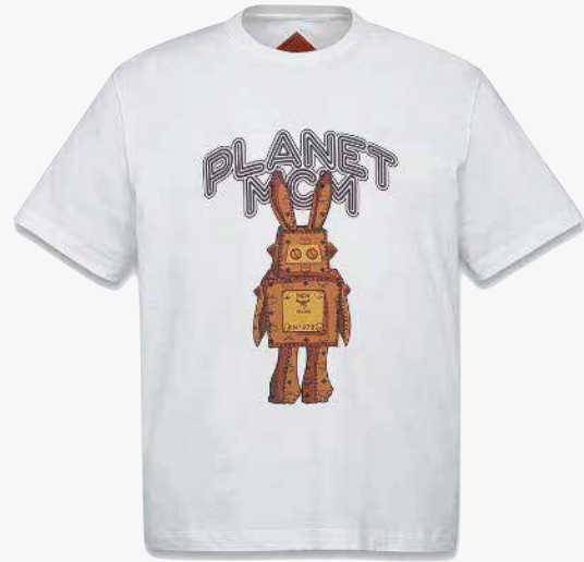
PLANET MCM RABOT T-SHIRT IN ORGANIC COTTON