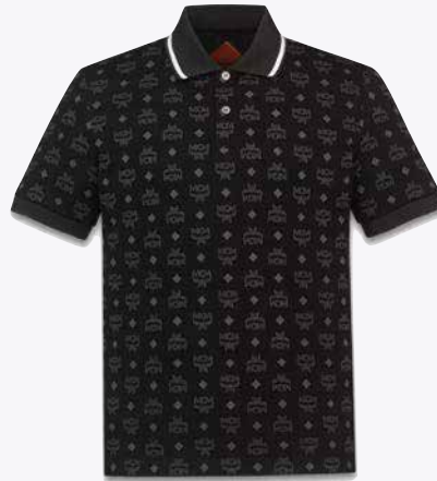
MONOGRAM JACQUARD POLO SHIRT