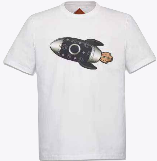
ROCKET T-SHIRT IN ORGANIC COTTON