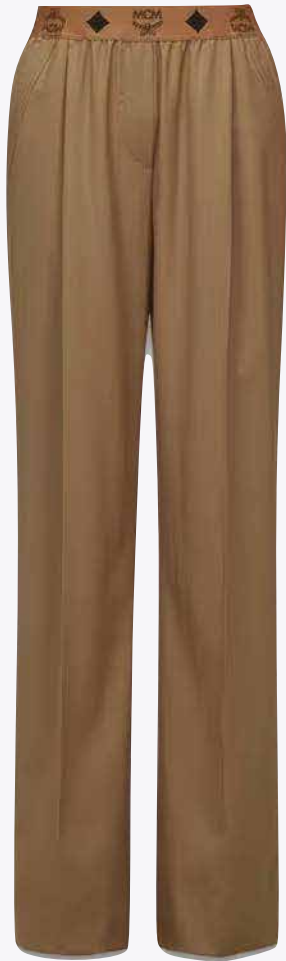
MONOGRAM PANTS IN WOOL TWILL