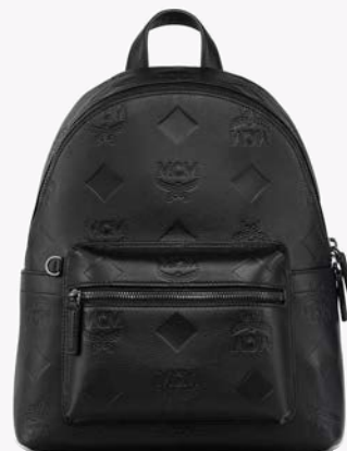
STARK BACKPACK IN MAXI MONOGRAM LEATHER (SMALL)