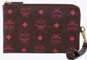
OTTOMAR TRAVEL POUCH IN VISETOS THB 12,500