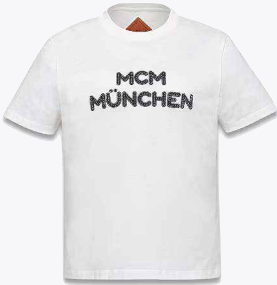
MÜNCHEN T-SHIRT IN ORGANIC COTTON