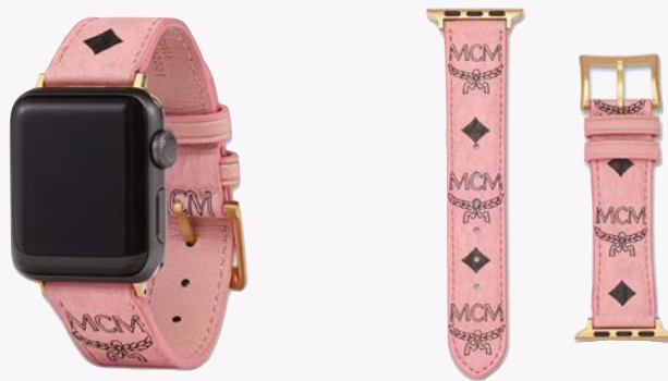
APPLE WATCH BAND IN VISETOS