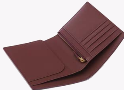
OTTOMAR PASSPORT HOLDER IN VISETOS THB 13,200