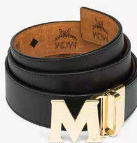
CLAUS M REVERSIBLE BELT 1.5 IN VISETOS (MEDIUM) THB 13,800