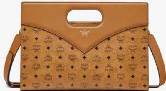
DIAMOND BAG IN VISETOS (MEDIUM) THB 42,800