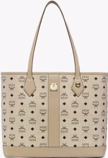
NEW LIZ SHOPPER IN VISETOS (MEDIUM) THB 30,300