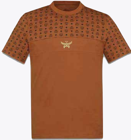
MONOGRAM PRINT T-SHIRT IN ORGANIC COTTON