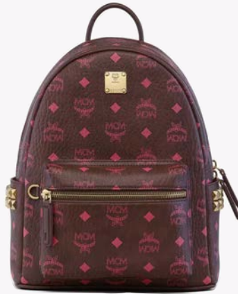
STARK SIDE STUDS BACKPACK IN VISETOS