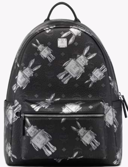
STARK BACKPACK IN RABOT VISETOS (MEDIUM) THB 55,100