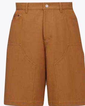
MONOGRAM PRINT T-SHIRT IN ORGANIC COTTON