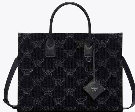
MÜNCHEN TOTE IN LAURETOS LUREX JACQUARD (LARGE) THB 44,100