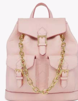
AREN DRAWSTRING BACKPACK IN MAXI MONOGRAM LEATHER (SMALL)