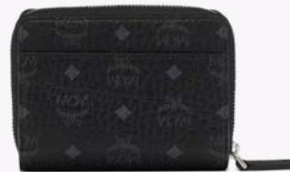
AREN BRASS PLATE WALLET IN VISETOS