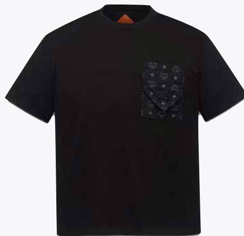
MONOGRAM PATCH POCKET T-SHIRT IN ORGANIC COTTON