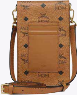
AREN PHONE WALLET IN VISETOS