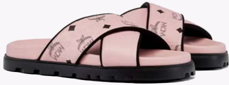
CROSS SANDAL IN VISETOS LEATHER MIX