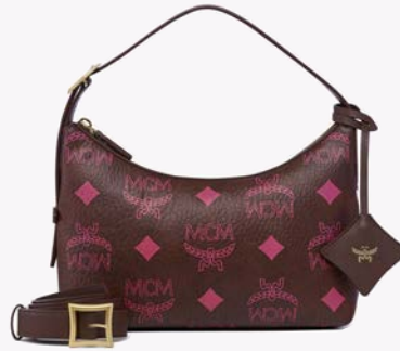
AREN HOBO IN MAXI VISETOS (SMALL) THB 35,200