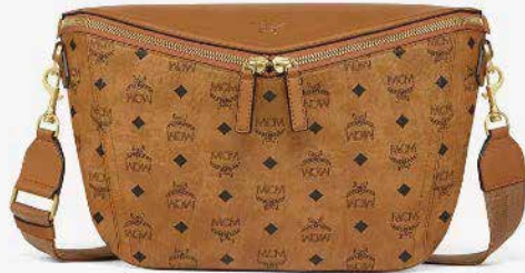
DIAMANT 3D CROSSBODY IN VISETOS LEATHER MIX (MEDIUM) THB 35,000