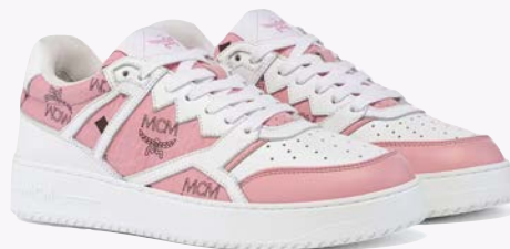
NEO TERRAIN SNEAKERS IN VISETOS LEATHER MIX