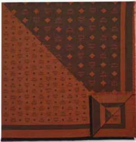
MONOGRAM SHAWL IN WOOL-SILK JACQUARD