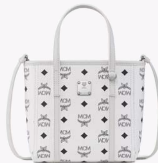
TONI TOP-ZIP SHOPPER IN VISETOS (MINI) THB 26,200