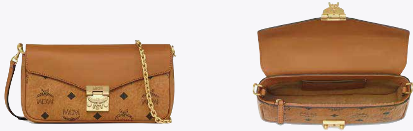
TRACY CROSSBODY IN VISETOS (MINI) THB 25,800