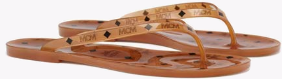
MONOGRAM JELLY THONG SANDALS