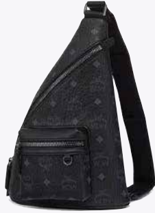
AREN SLING IN VISETOS (MINI) THB 30,000