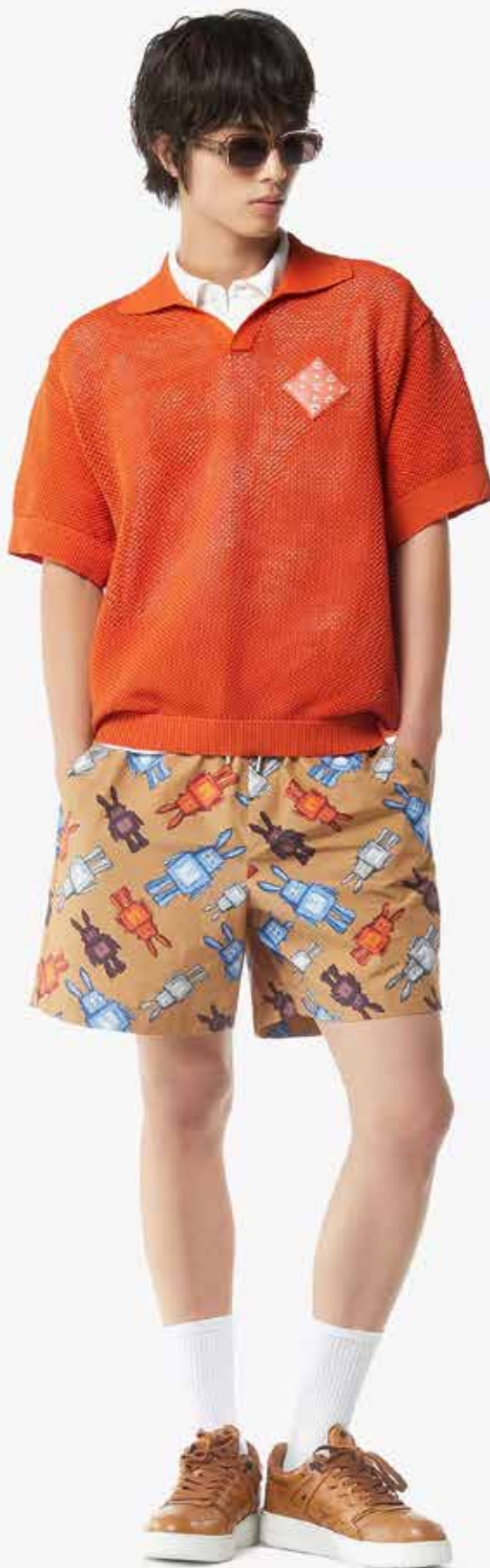
VISETOS PATCH MESH KNIT POLO SIZE : S,M,L THB 15,800