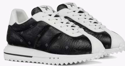
DIAMANTE SNEAKERS IN QUILTED MONOGRAM LEATHER