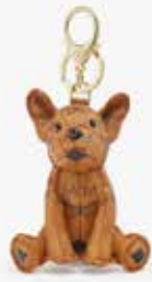
AREN FRENCH BULLDOG CHARM IN VISETOS