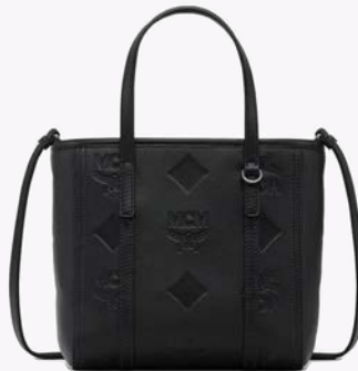
TONI TOP-ZIP SHOPPER IN MAXI MONOGRAM LEATHER (MINI)