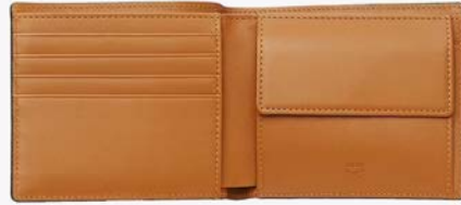
BIFOLD WALLET WITH COIN POCKET IN VISETOS ORIGINAL THB 13,200