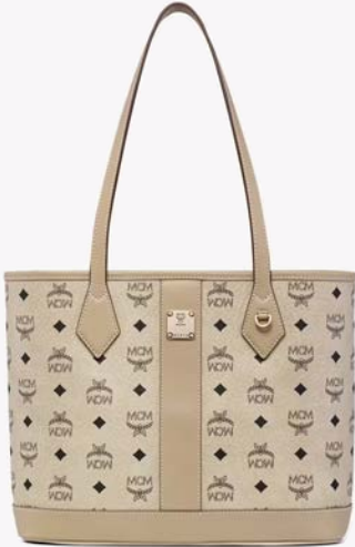
NEW LIZ SHOPPER IN VISETOS (SMALL) THB 29,200