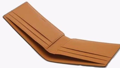
BIFOLD WALLET IN VISETOS ORIGINAL THB 13,200