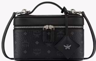
AREN VANITY CASE IN VISETOS LEATHER MIX (SMALL) THB 28,800