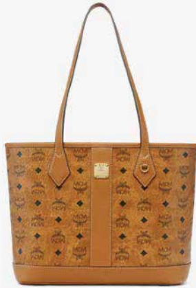
NEW LIZ SHOPPER IN VISETOS (SMALL) THB 28,100