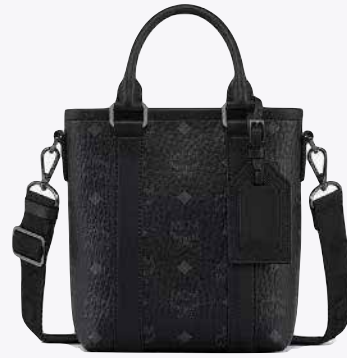
AREN TOTE IN VISETOS (MINI) THB 27,700