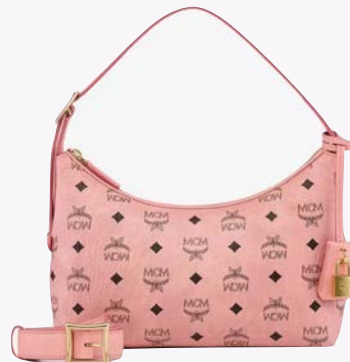
AREN HOBO IN VISETOS (MEDIUM)