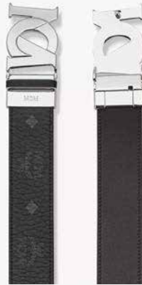
M-ART REVERSIBLE BELT 1.5" IN VISETOS