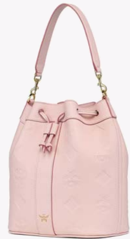
DESSAU DRAWSTRING BAG IN MAXI MONOGRAM LEATHER (SMALL)