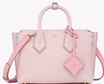
MILLA TOTE IN GRAINED LEATHER (SMALL)