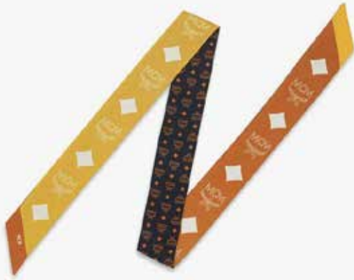
MONOGRAM PRINT IN PETITE SCARF