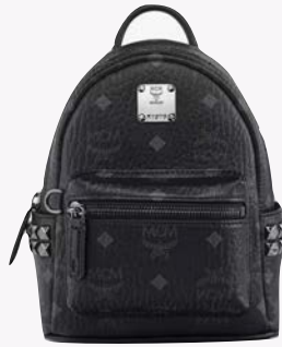
STARK SIDE STUDS BACKPACK IN VISETOS (X-MINI : 20 CM.) THB 37,500