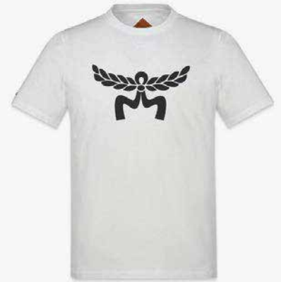
LAUREL LOGO PRINT T-SHIRT IN ORGANIC COTTON SIZE :S,M,L,XL THB 11,000