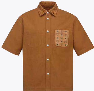
SHIRT IN COTTON AND MONOGRAM PRINT LEATHER