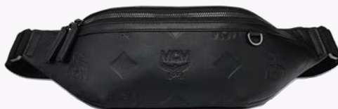
FURSTEN BELT BAG IN MAXI MONOGRAM LEATHER