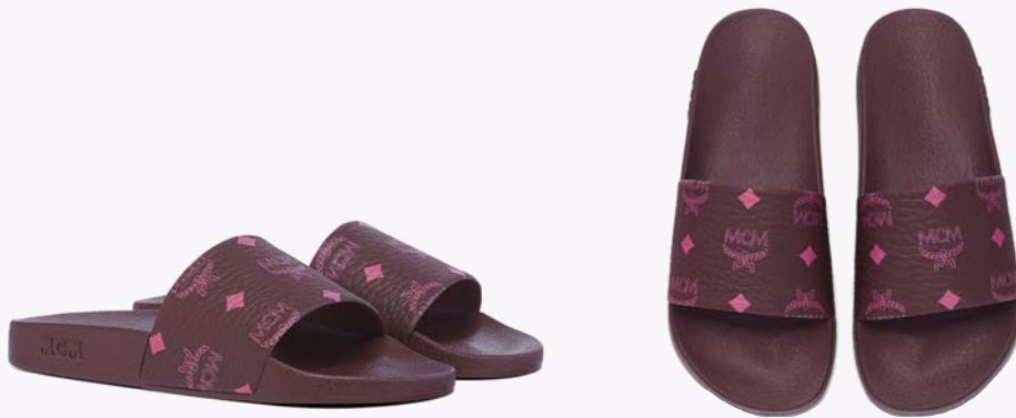
MONOGRAM PRINT RUBBER SLIDES SIZE : 36,37,38,39 THB 9,400