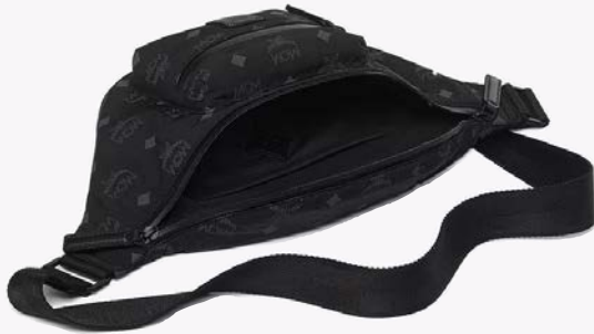
FURSTEN BELT BAG IN MONOGRAM NYLON THB 18,100