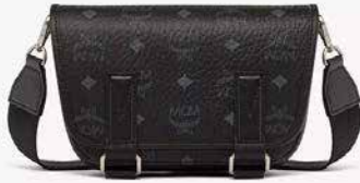
AREN MESSENGER BAG IN VISETOS (MINI) THB 28,600