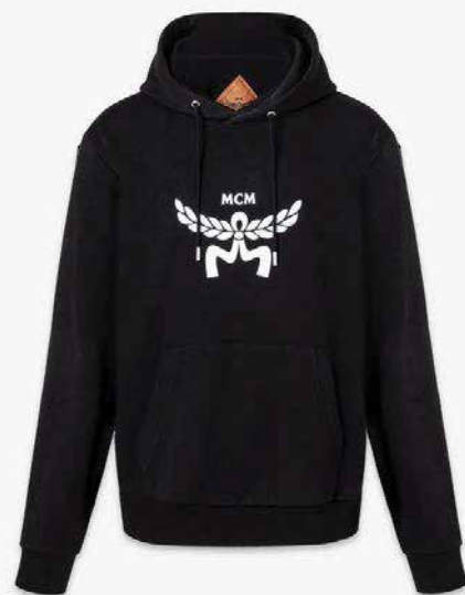
CLASSIC LOGO HOODIE IN ORGANIC COTTON SIZE : S,M,L,XL THB 19,000