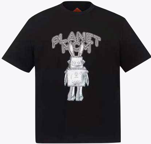
PLANET MCM RABOT T-SHIRT IN ORGANIC COTTON