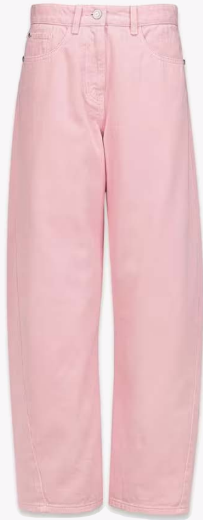
WASHED DENIM JEANS SIZE : 40,42 THB 20,400