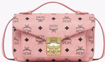
TRACY CROSSBODY IN VISETOS (MEDIUM)