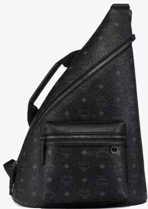
AREN SLING IN VISETOS (MEDIUM) THB 33,800