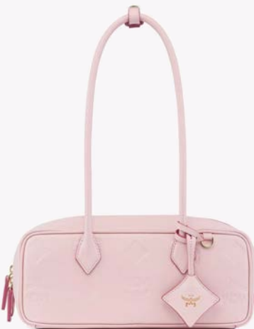
AREN EAST WEST SHOULDER BAG IN MAXI MONOGRAM LEATHER