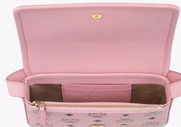
AREN CROSSBODY WALLET IN VISETOS