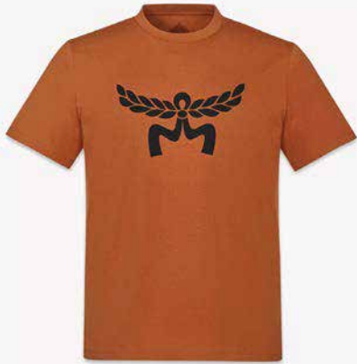
LAUREL LOGO PRINT T-SHIRT IN ORGANIC COTTON SIZE :S,M,L,XL THB 11,000