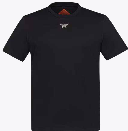
ESSENTIAL LOGO PRINT T-SHIRT IN ORGANIC COTTON