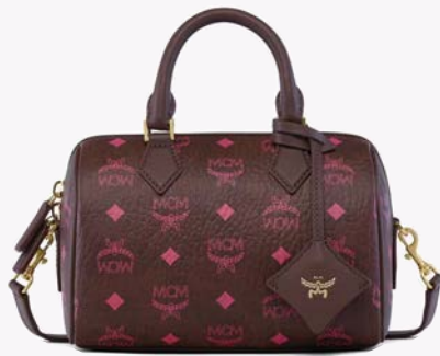
ELLA BOSTON BAG IN MAXI VISETOS (SMALL) THB 35,300