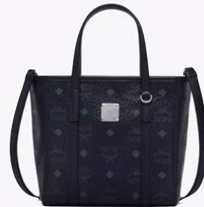
TONI TOP-ZIP SHOPPER IN VISETOS (MINI) THB 26,200