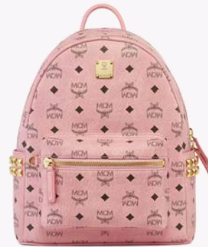
STARK SIDE STUDS BACKPACK IN VISETOS (SMALL)