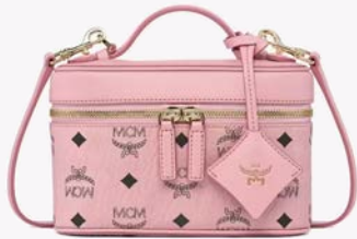
AREN VANITY CASE IN VISETOS LEATHER MIX (MINI) THB 24,000