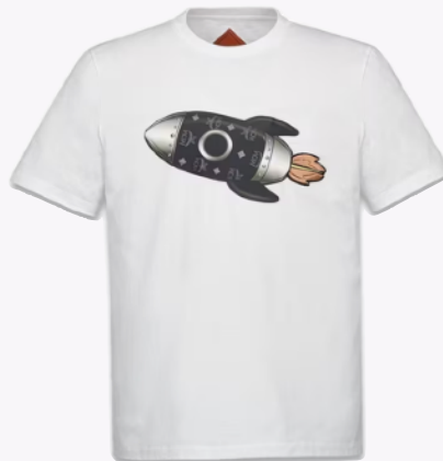
ROCKET T-SHIRT IN ORGANIC COTTON SIZE : S,M,L,XL THB 11,200 / NOW THB 5,600