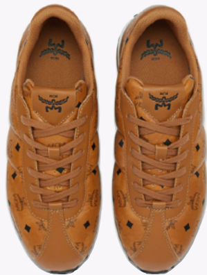
DIAMANTE SNEAKERS IN QUILTED MONOGRAM LEATHER

SIZE 36,37,38,39,40 THB 17,500 / NOW THB 10,500