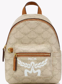
STARK BEBE BOO BACKPACK IN LAURETOS (X-MINI)