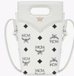
DIAMOND CROSSBODY POUCH IN VISETOS LEATHER MIX THB 18,000 / NOW THB 7,200