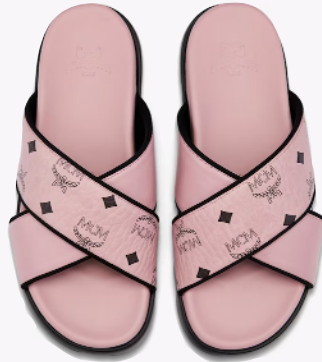
CROSS SANDAL IN VISETOS LEATHER MIX

SIZE 36,37,38,39,40 THB 7,900 / NOW THB 4,740