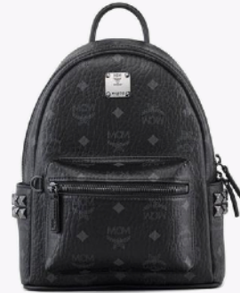
STARK SIDE STUDS BACKPACK IN VISETOS (MINI) THB 42,300 / NOW THB 29,610