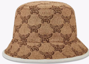
BUCKET HAT IN LAURETOS RAFFIA JACQUARD THB 13,500 / NOW THB 5,400