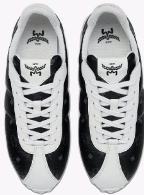
DIAMANTE SNEAKERS IN QUILTED MONOGRAM LEATHER

SIZE 41,42,43 THB 17,200 / NOW THB 10,320