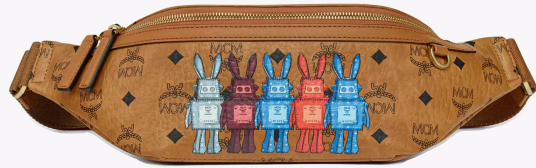
FURSTEN BELT BAG IN RABOT VISETOS (MEDIUM) THB 30,300 / NOW THB 18,180