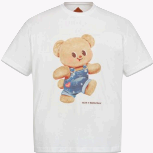
MCM X BUTTERBEAR T-SHIRT SIZE : XS,S THB 11,200 / NOW THB 4,480