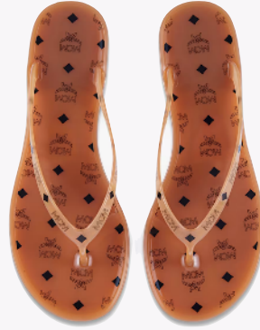
MONOGRAM JELLY THONG SANDALS

SIZE 36,37,38,39,40,41,42,43,44,45 THB 9,000 / NOW THB 5,400