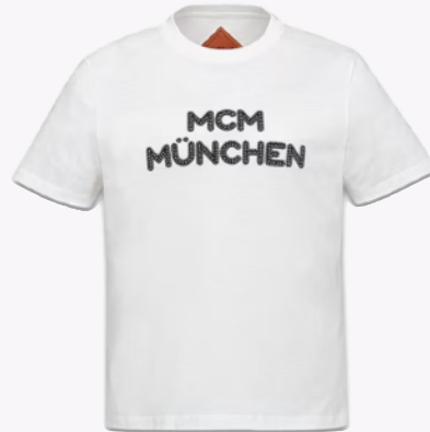
MÜNCHEN T-SHIRT IN ORGANIC COTTON SIZE : S,M,L THB 12,300 / NOW THB 6,150