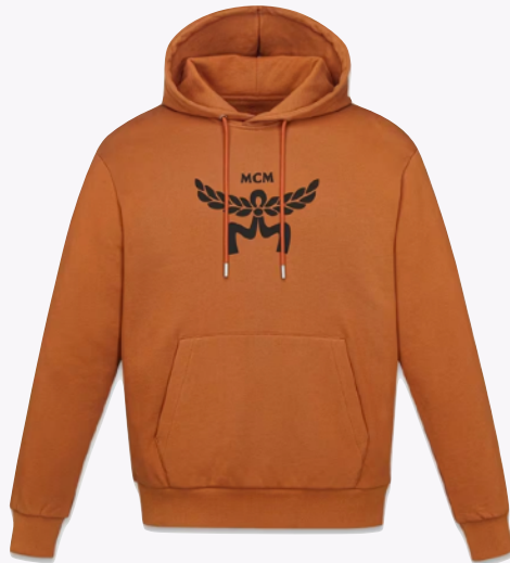
CLASSIC LOGO HOODIE IN ORGANIC COTTON SIZE : M,L,XL THB 19,000 / NOW THB 9,500