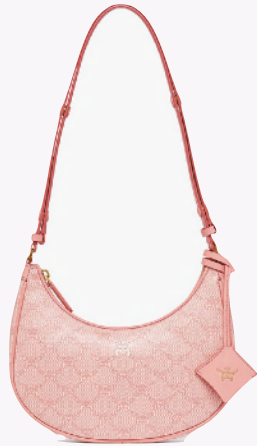
HIMMEL ASCENDING MOON HOBO IN LAURETOS