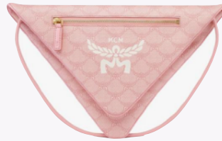
HIMMEL TRIANGLE POUCH IN LAURETOS THB 19,200 / NOW THB 7,680