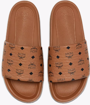
MONOGRAM PRINT RUBBER SLIDES

SIZE 36,37,38,39,40,41,42,43,44,45 THB 9,000 / NOW THB 5,400