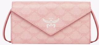
HIMMEL CROSSBODY WALLET IN LAURETOS THB 21,500 / NOW THB 8,600