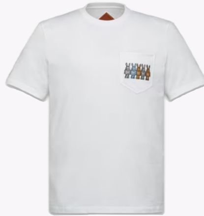
RABOT POCKET T-SHIRT IN ORGANIC COTTON SIZE : S,M,XL THB 11,200 / NOW THB 5,600