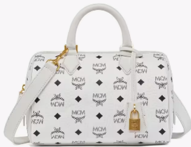
ELLA BOSTON BAG IN VISETOS (SMALL)