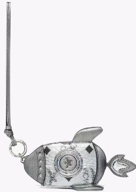
AREN ROCKET POUCH CHARM IN VISETOS THB 12,300 / NOW THB 7,380