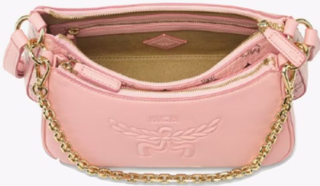
AREN DUO HOBO IN VISETOS THB 35,200 / NOW THB 17,600