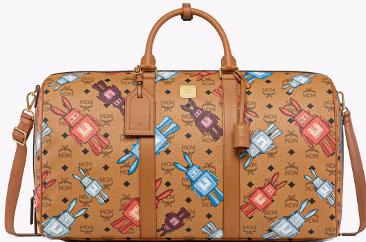
OTTOMAR WEEKENDER BAG IN RABOT VISETOS (X-Large) THB 64,300 / NOW THB 38,580