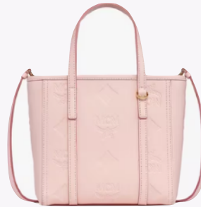
TONI TOP-ZIP SHOPPER IN MAXI MONOGRAM LEATHER (MINI) THB 33,000 / NOW THB 23,100