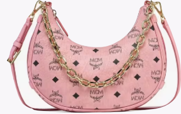
AREN CRESCENT HOBO BAG IN VISETOS