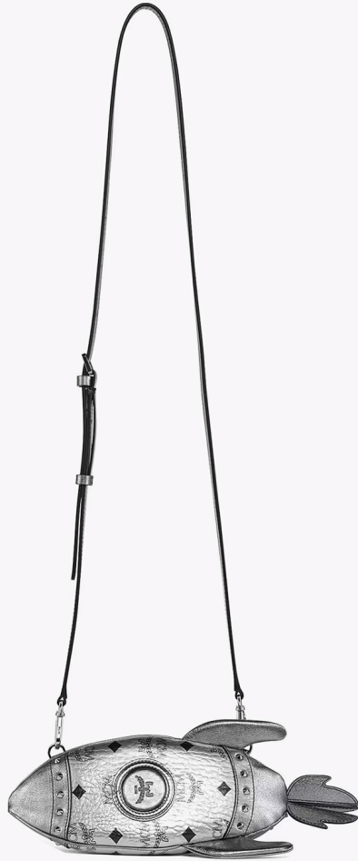
AREN ROCKET CROSSBODY IN VISETOS THB 24,100 / NOW THB 14,460