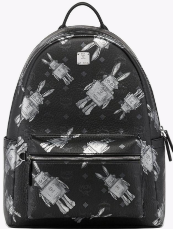
STARK BACKPACK IN RABOT VISETOS (MEDIUM)