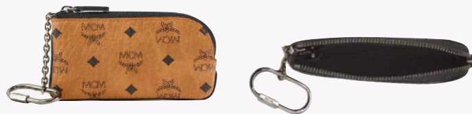
KEY POUCH IN VISETOS THB 9,200 / NOW THB 4,600