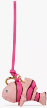
HIMMEL 3D CLOWNFISH CHARM IN LAURETOS