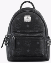
STARK SIDE STUDS BACKPACK IN VISETOS (X-MINI)