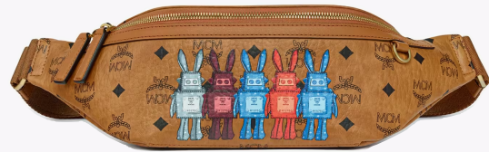
FURSTEN BELT BAG IN RABOT VISETOS (MEDIUM) THB 30,300 / NOW THB 18,180