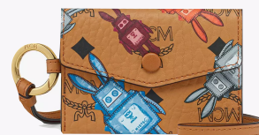
AREN LANYARD ID WALLET IN RABOT VISETOS (SMALL) THB 9,600 / NOW THB 5,760