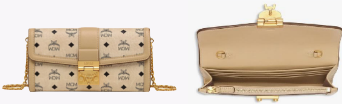
TRIFOLD CHAIN WALLET IN VISETOS (LARGE) THB 23,600 / NOW THB 11,800