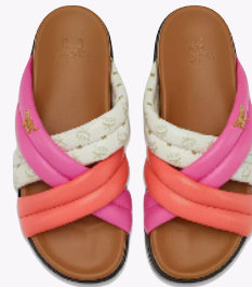
MONOGRAM CROSS SANDALS IN LAMB LEATHER SIZE : 37,39 THB 23,900 / NOW THB 9,560