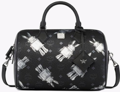
ELLA BOSTON BAG IN RABOT VISETOS (MEDIUM)