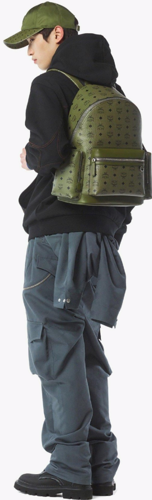
STARK BACKPACK IN VISETOS (MEDIUM) THB 51,500 / NOW THB 25,750