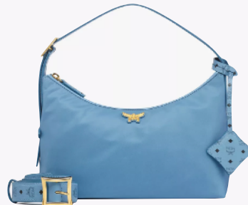
AREN HOBO IN RECYCLED NYLON AND MONOGRAM PRINT LEATHER THB 27,300 / NOW THB 10,920