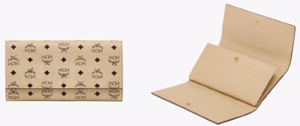
TRIFOLD WALLET IN VISETOS (LARGE) THB 17,500 / NOW THB 8,750