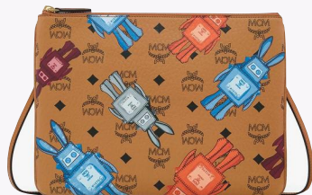
AREN CROSSBODY POUCH (SMALL) THB 22,800 / NOW THB 13,680