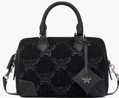
ELLA BOSTON BAG IN LAURETOS LUREX JACQUARD (SMALL) THB 35,300 / NOW THB 21,180