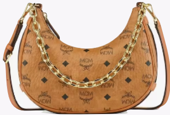
AREN CRESCENT HOBO BAG IN VISETOS