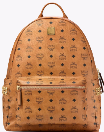
STARK SIDE STUDS BACKPACK IN VISETOS (MEDIUM)