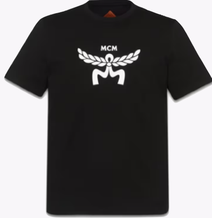
LAUREL LOGO PRINT T-SHIRT IN ORGANIC COTTON SIZE : S,M,L,XL THB 11,000 / NOW THB 5,500