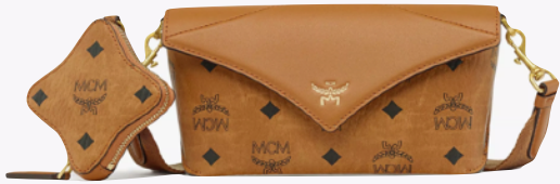
DIAMOND CROSSBODY WITH AIRPODS PRO CHARM IN VISETOS THB 26,100 / NOW THB 10,440