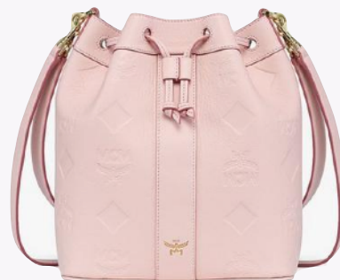
DESSAU DRAWSTRING BAG IN MAXI MONOGRAM LEATHER (MEDIUM) THB 46,700 / NOW THB 32,690