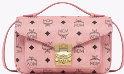
TRACY CROSSBODY IN VISETOS (MEDIUM)