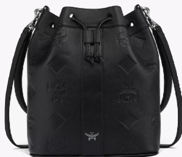
DESSAU DRAWSTRING BAG IN MAXI MONOGRAM LEATHER (MEDIUM) THB 46,700 / NOW THB 32,690