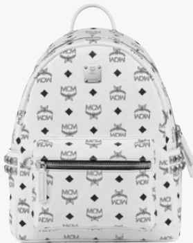
STARK SIDE STUDS BACKPACK IN VISETOS (SMALL)