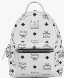
STARK SIDE STUDS BACKPACK IN VISETOS (X-MINI)