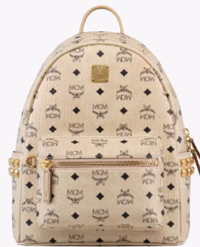
STARK SIDE STUDS BACKPACK IN VISETOS (SMALL)