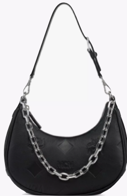
AREN CRESCENT HOBO BAG IN MAXI MONOGRAM LEATHER (SMALL) THB 42,300 / NOW THB 29,610