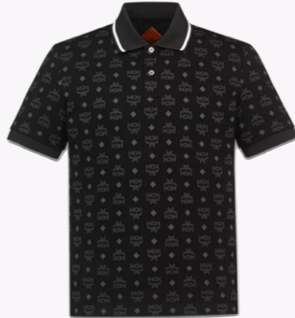
MONOGRAM JACQUARD POLO SHIRT SIZE : S,M,L THB 18,500 / NOW THB 9,250