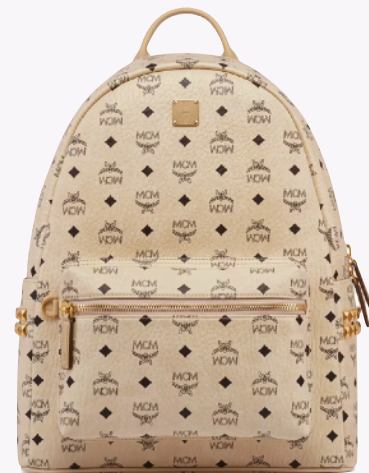
STARK SIDE STUDS BACKPACK IN VISETOS (MEDIUM)