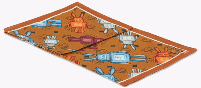
RABOT MONOGRAM PRINT BANDANA SCARF