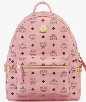
STARK SIDE STUDS BACKPACK IN VISETOS (SMALL)