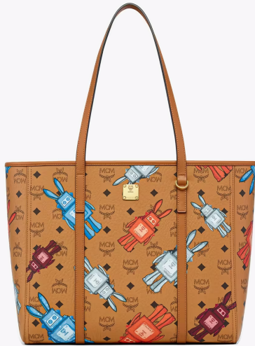
TONI TOP-ZIP SHOPPER IN RABOT VISETOS (MEDIUM) THB 32,200 / NOW THB 19,320