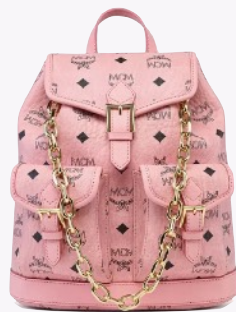
AREN DRAWSTRING BACKPACK IN VISETOS (MINI)