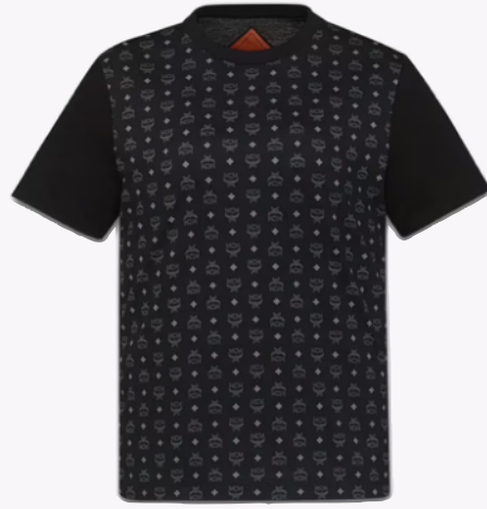
MONOGRAM PRINT T-SHIRT IN ORGANIC COTTON SIZE : M,L THB 12,300 / NOW THB 6,150