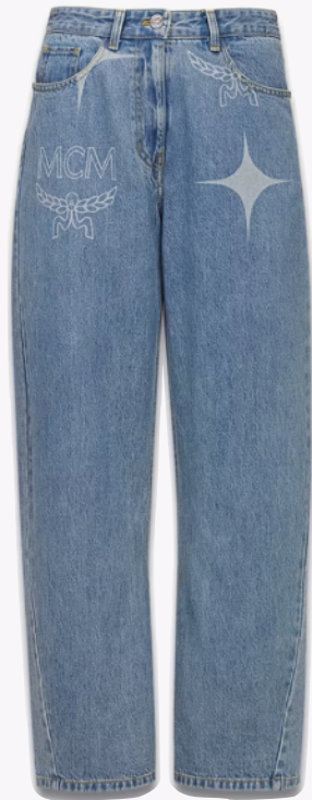
CONSTELLATION DENIM JEANS SIZE : 38,40 THB 20,400 / NOW THB 10,200