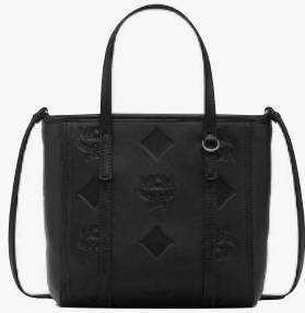
TONI TOP-ZIP SHOPPER IN MAXI MONOGRAM LEATHER (MINI) THB 33,000 / NOW THB 23,100