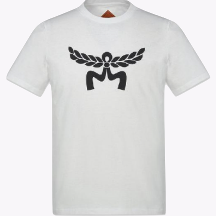
LAUREL LOGO PRINT T-SHIRT IN ORGANIC COTTON SIZE : M,L THB 11,000 / NOW THB 5,500