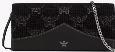
DIAMOND CLUTCH IN LAURETOS LUREX JACQUARD (SMALL) THB 31,300 / NOW THB 18,780