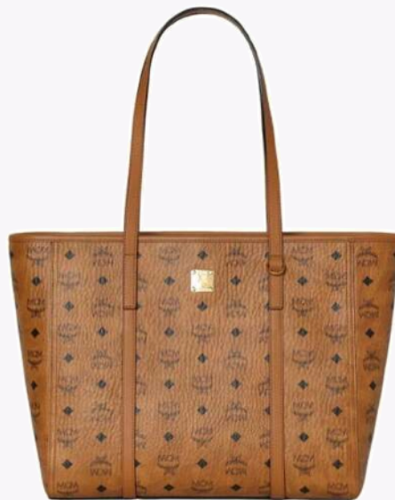
TONI TOP-ZIP SHOPPER IN VISETOS (MEDIUM) THB 29,200 / NOW THB 20,440