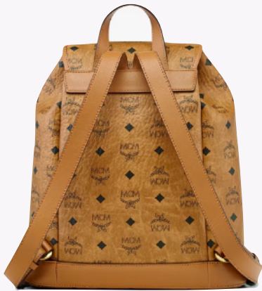
AREN DRAWSTRING BACKPACK IN VISETOS THB 42,300 / NOW THB 29,610