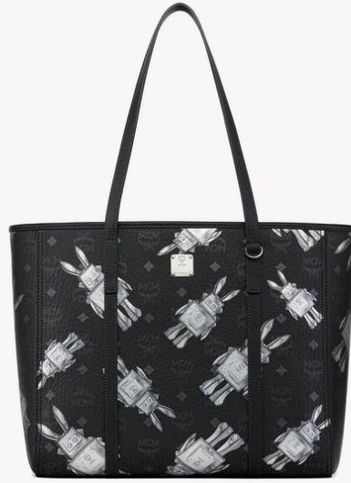
TONI TOP-ZIP SHOPPER IN RABOT VISETOS (MEDIUM)