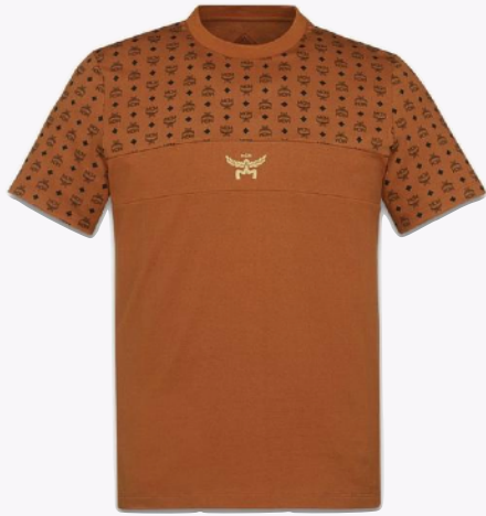
MONOGRAM PRINT T-SHIRT IN ORGANIC COTTON SIZE : S,M,L,XL THB 12,300 / NOW THB 6,150