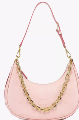
AREN CRESCENT HOBO BAG IN MAXI MONOGRAM LEATHER (SMALL) THB 42,300 / NOW THB 29,610