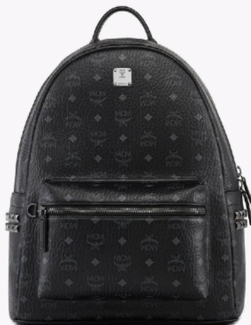
STARK SIDE STUDS BACKPACK IN VISETOS (MEDIUM)