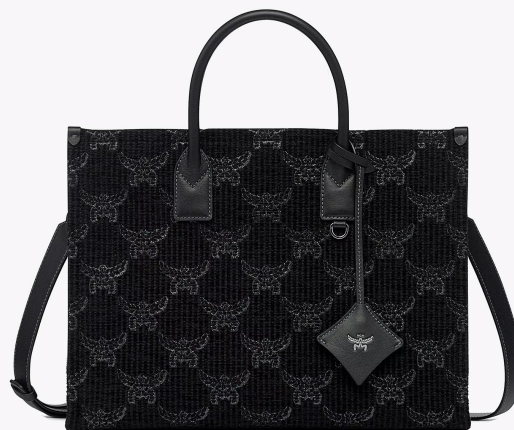
MÜNCHEN TOTE IN LAURETOS LUREX JACQUARD (LARGE) THB 44,100 / NOW THB 26,460