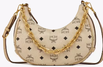
AREN CRESCENT HOBO BAG IN VISETOS